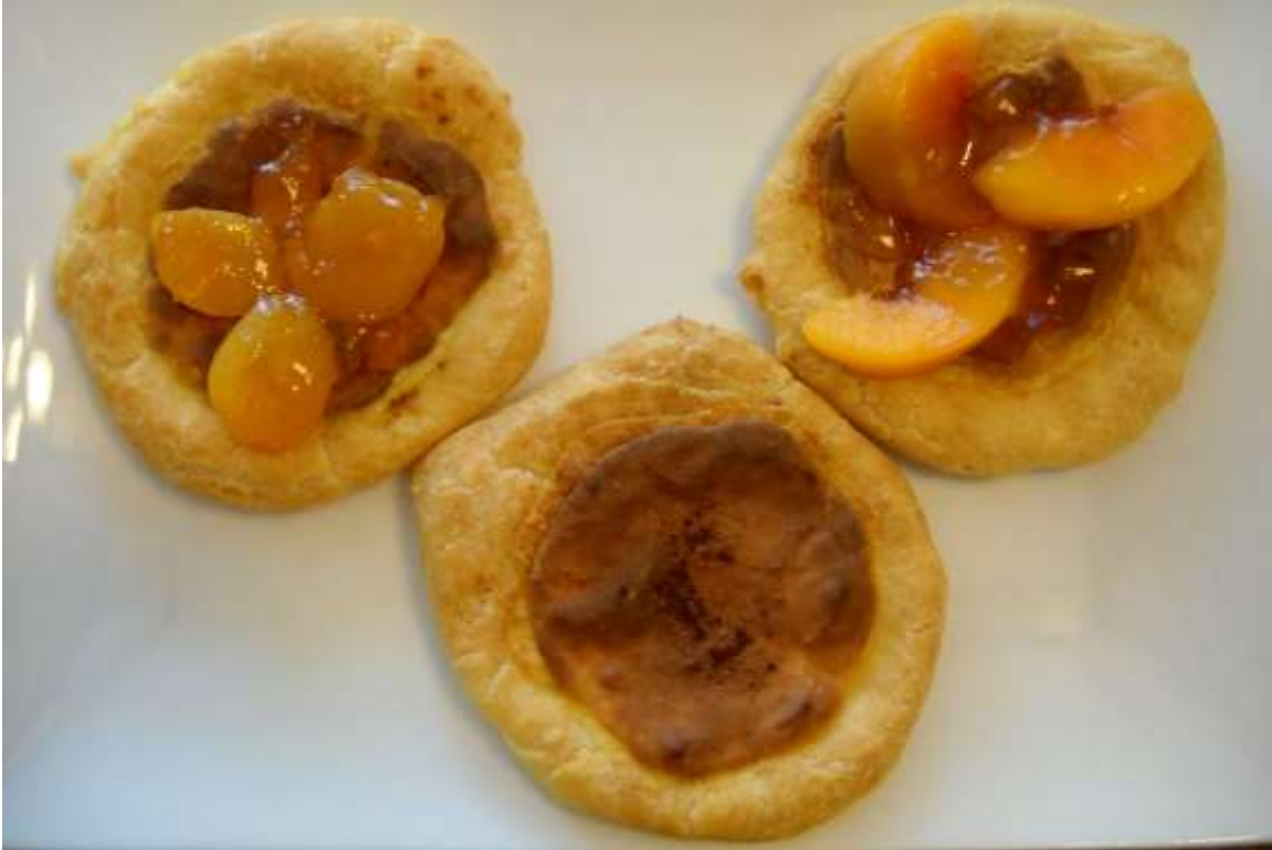
Figure 17. Individual Cream Filled Apricot, Peach and Plain Danish