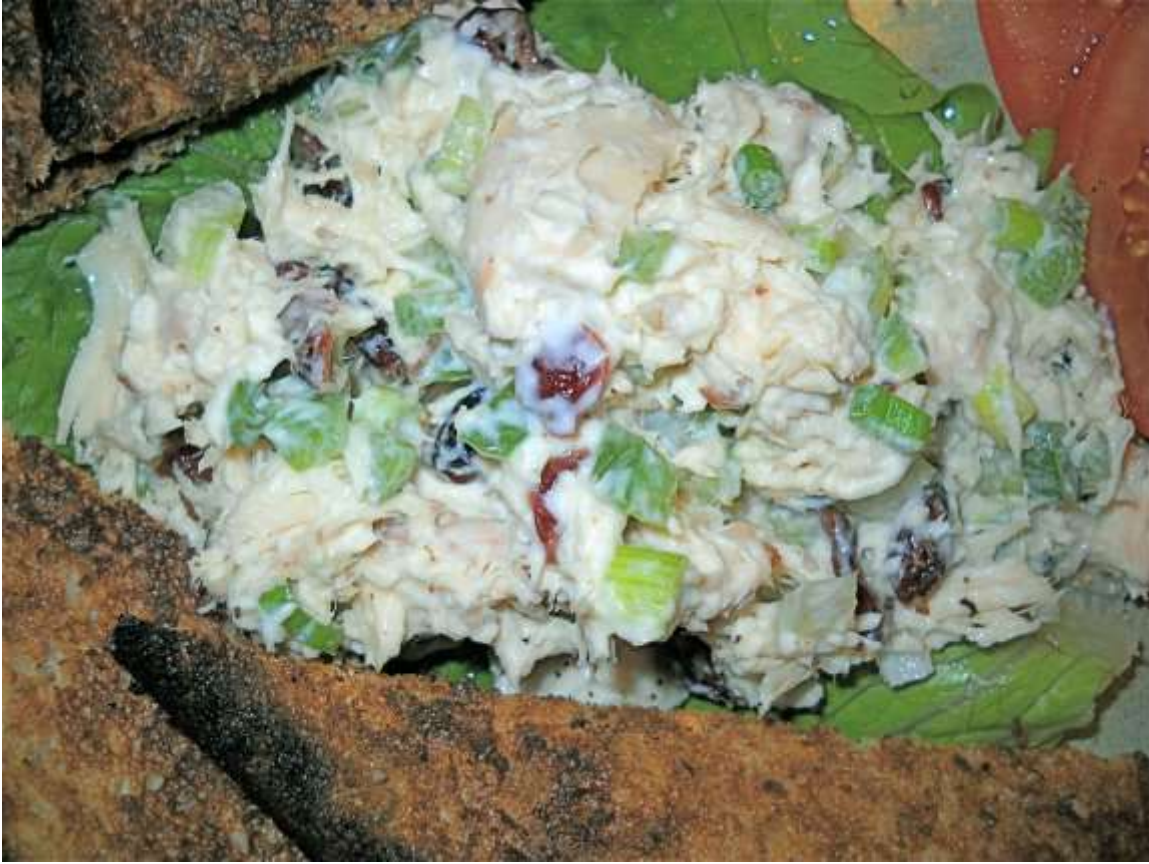
Figure 63. Chicken Salad