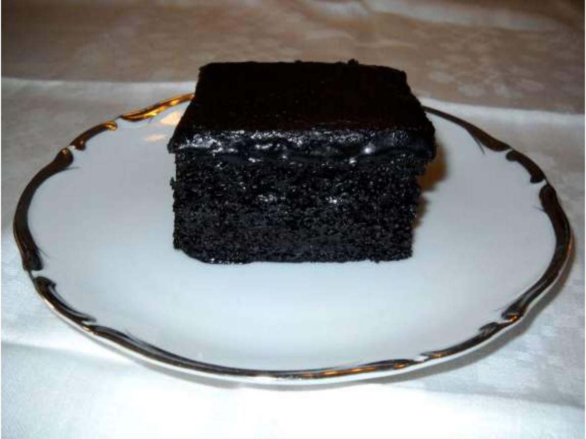
Figure 31. Chocolate Fudge Cake