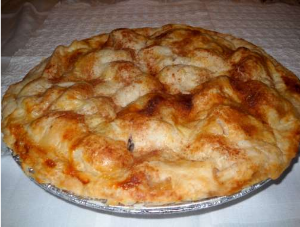
Figure 51. Pear Pie