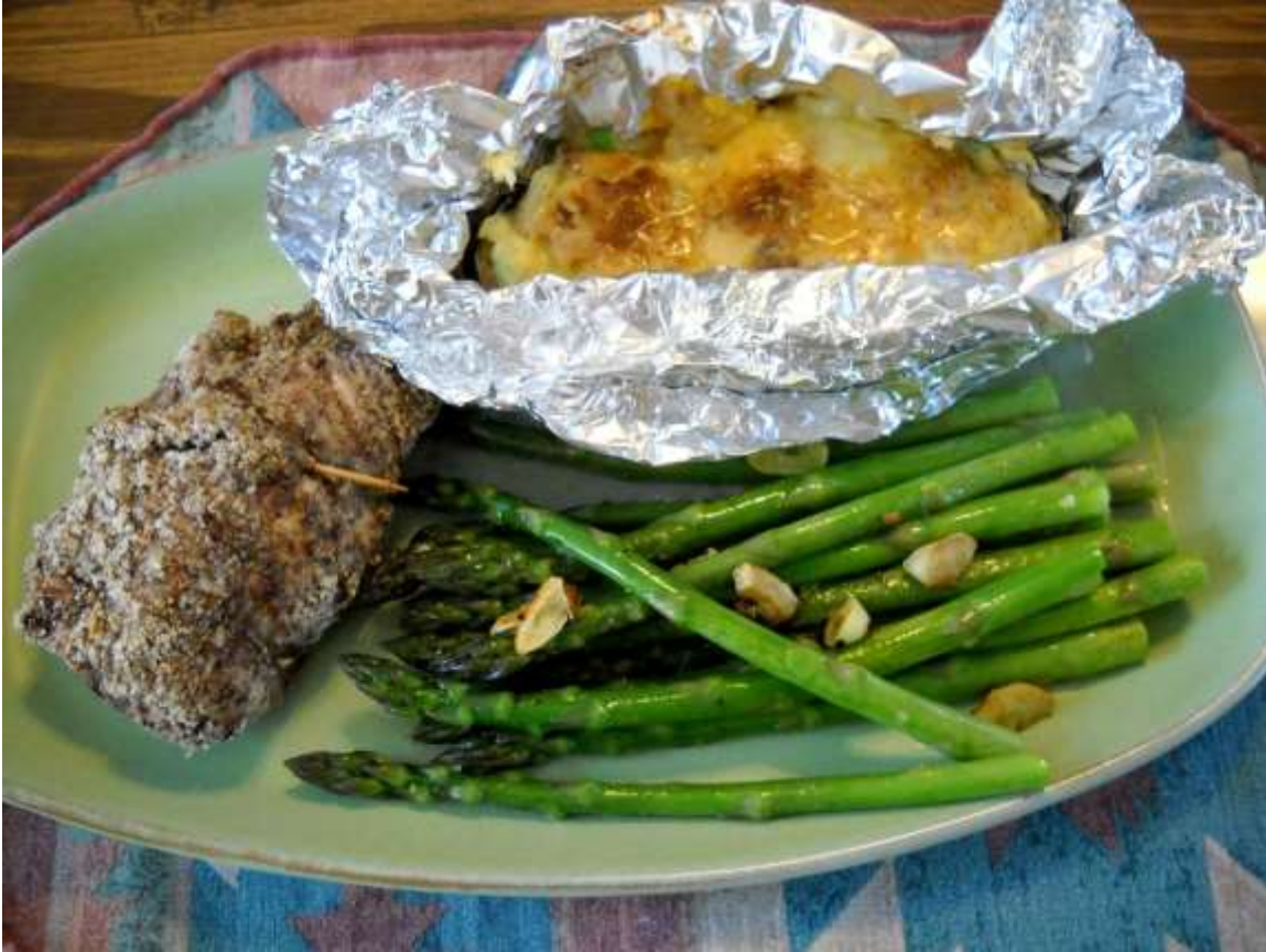
Figure 56. Turkey Accompagne dinner with Twice Baked Potato and Asparagus Sautéed in Garlic Butter