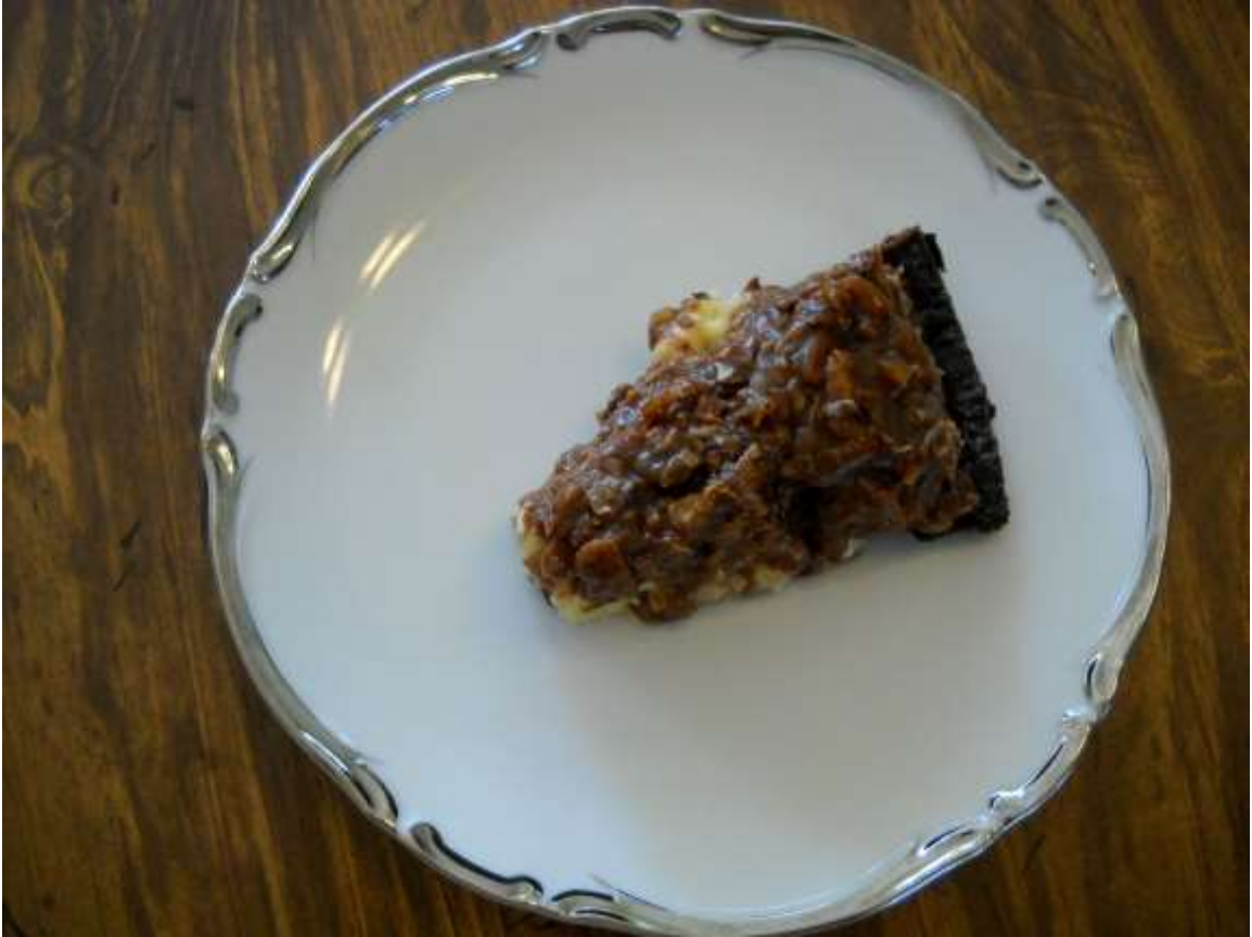
Figure 50. German Chocolate Pie