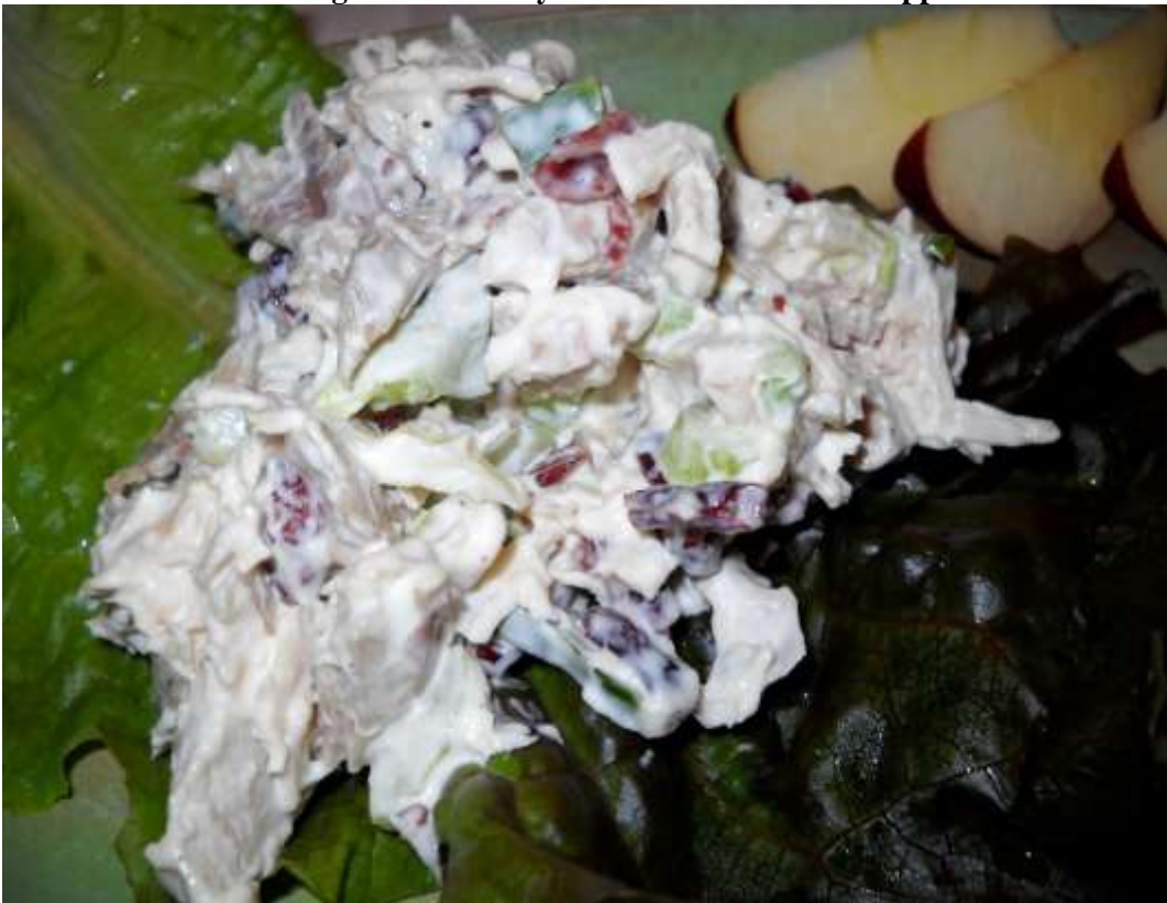
Figure 70. Close-up of Turkey Salad with Fresh Apples