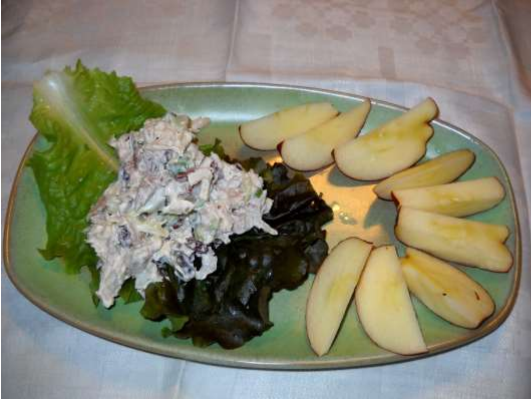
Figure 69. Turkey salad served with fresh apple.