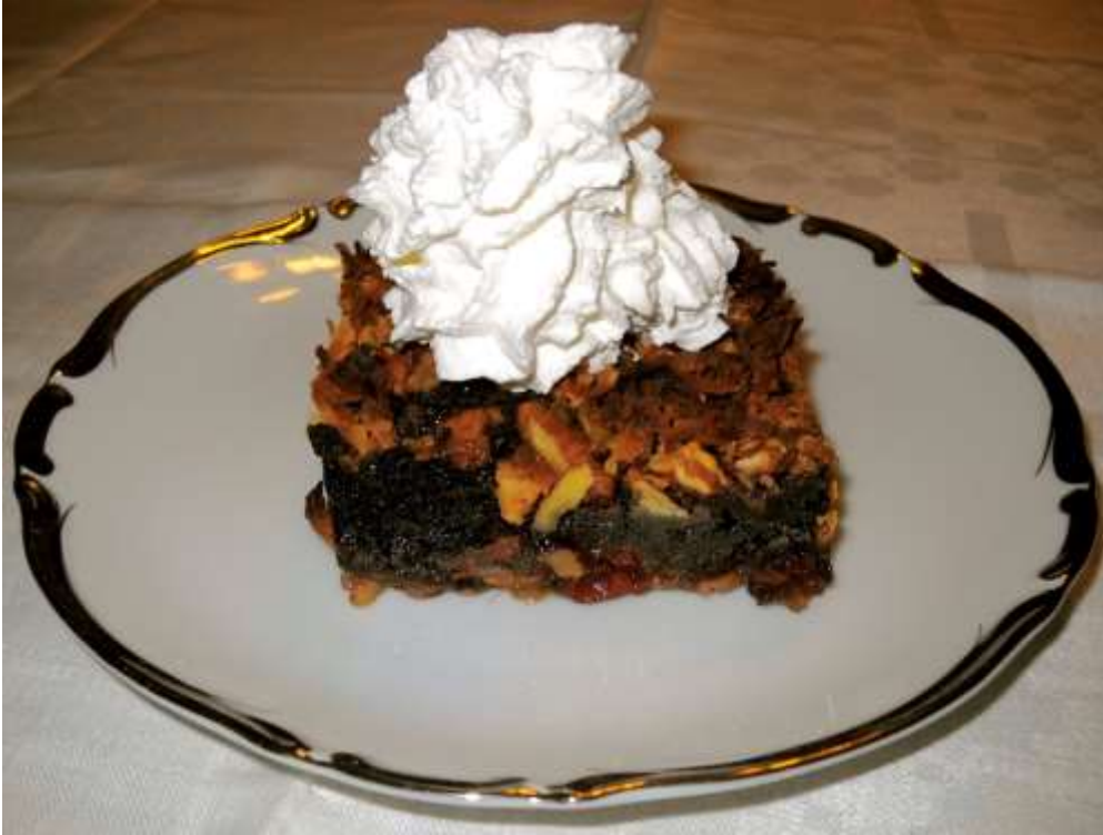
Figure 36. Chocolate Cherry Pineapple Dump Cake