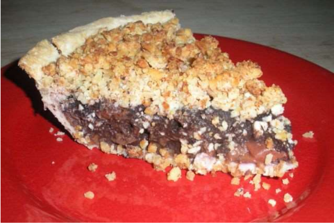
Figure 48. Chocolate Cherry Almond Crunch Pie – No Sugar Added – Photo by T. Wayne Furr