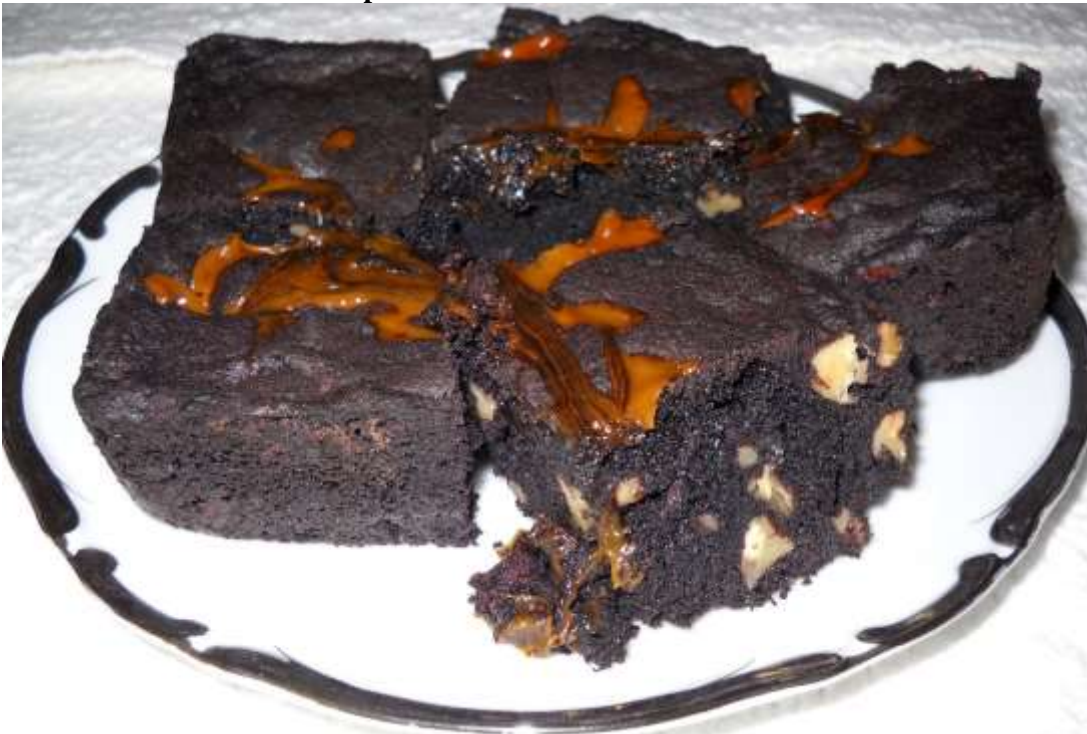
Figure 23. Turtle Brownies made with Hershey's® Special Dark Dutch Processed Cocoa