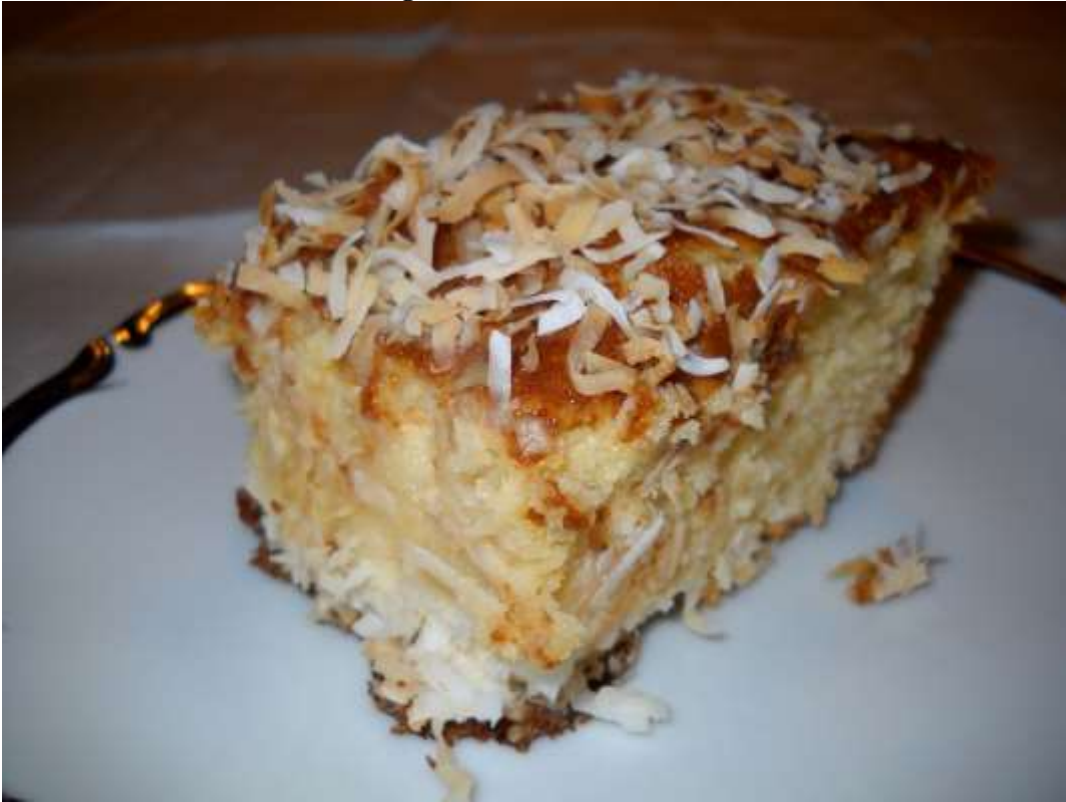
Figure 33. Piece of the Coconut Cream Cake