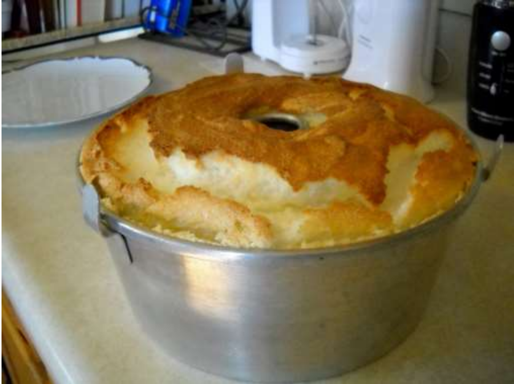
Figure 25. Angel Food Cake in the tube pan – Note “feet” on the top of the pan.