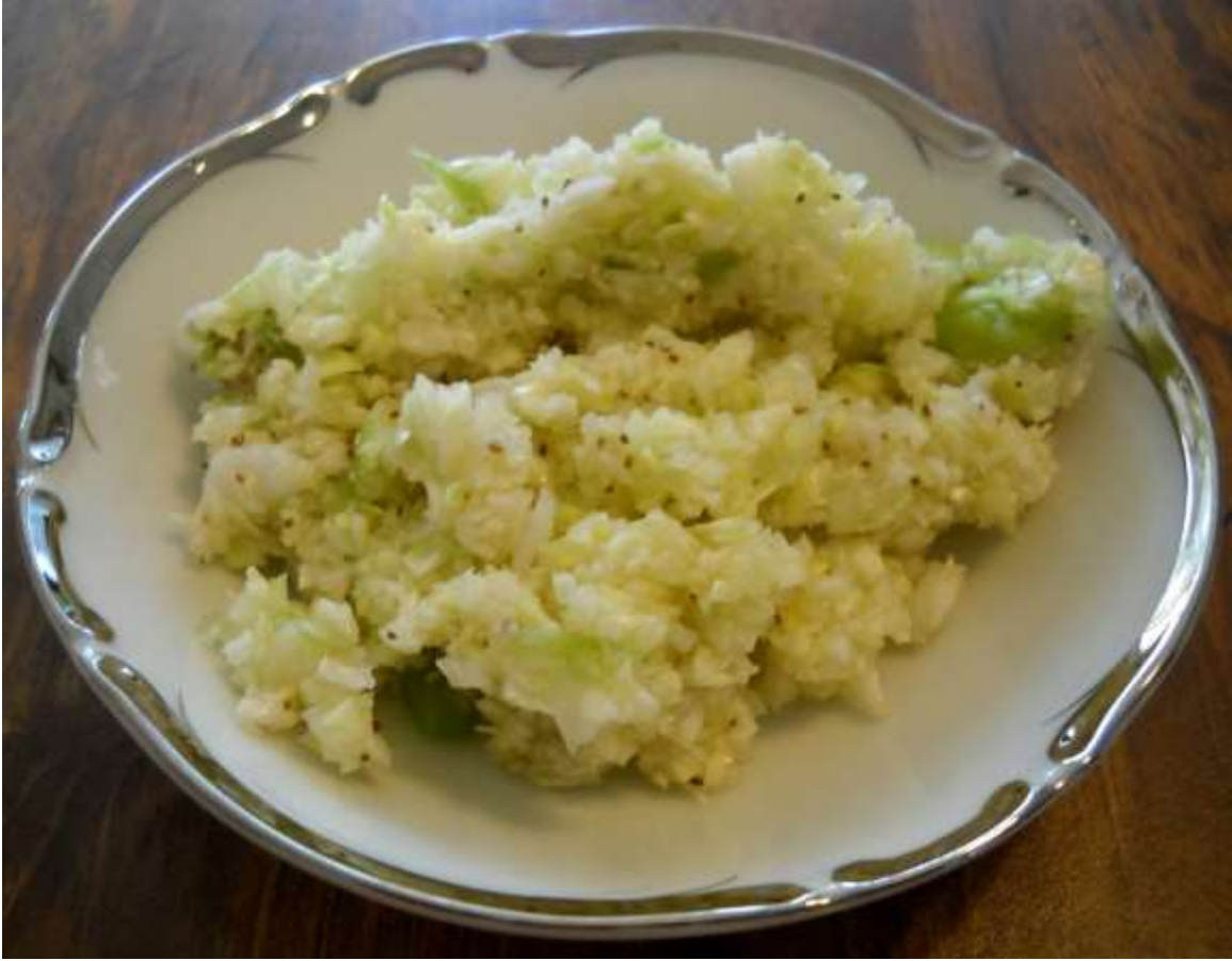
Figure 66. 9-Day Slaw