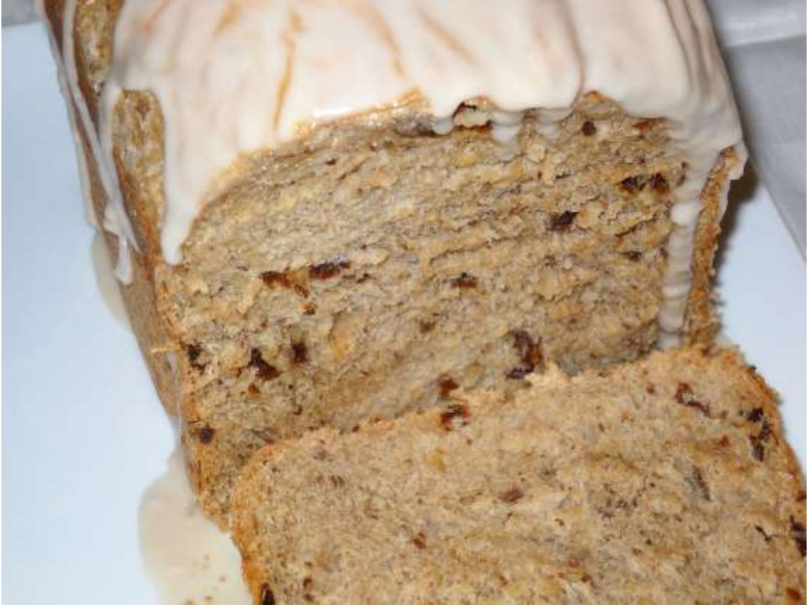
Figure 12. Cinnamon Raisin Bread