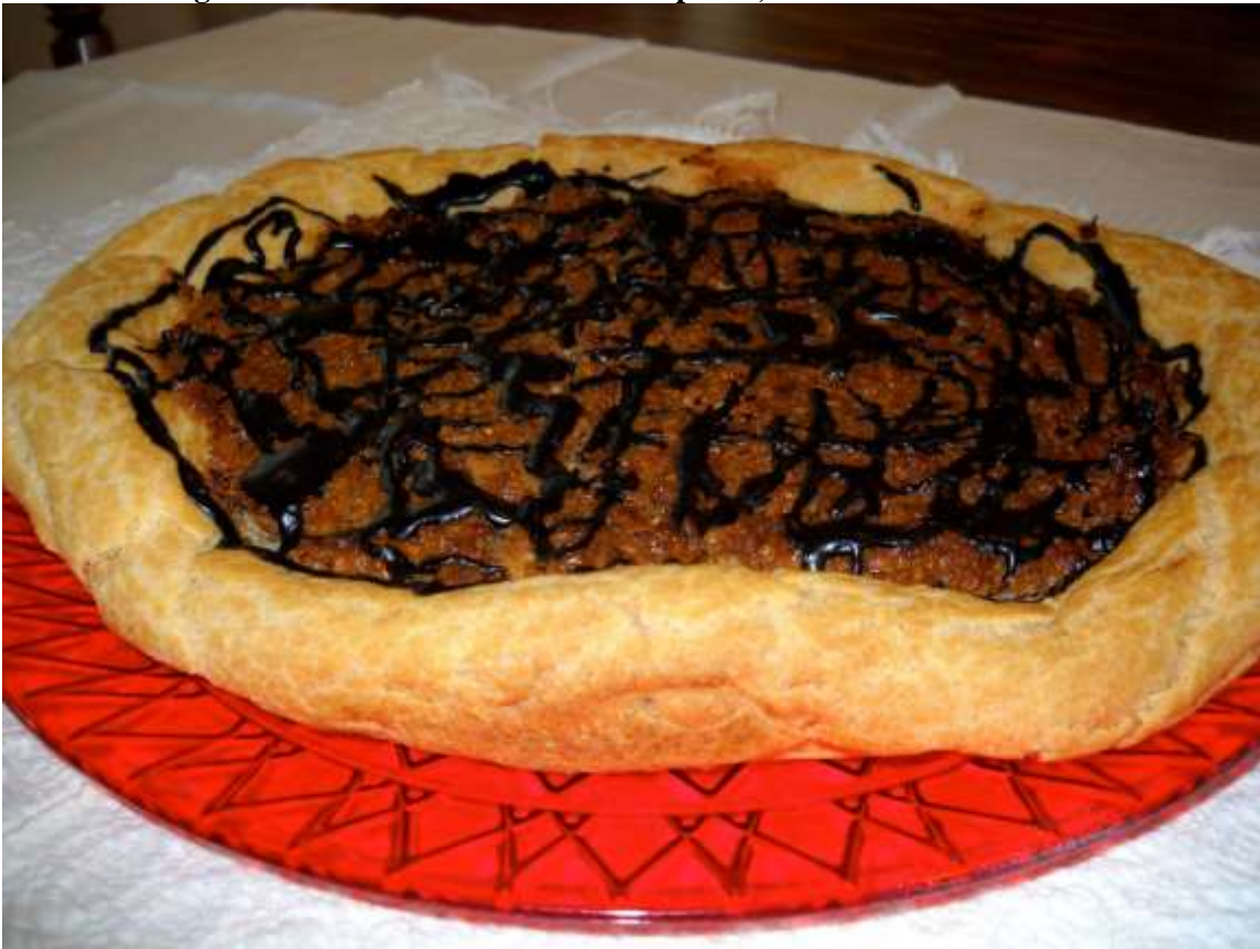
Figure 18. Full Sized Coconut Pecan Danish