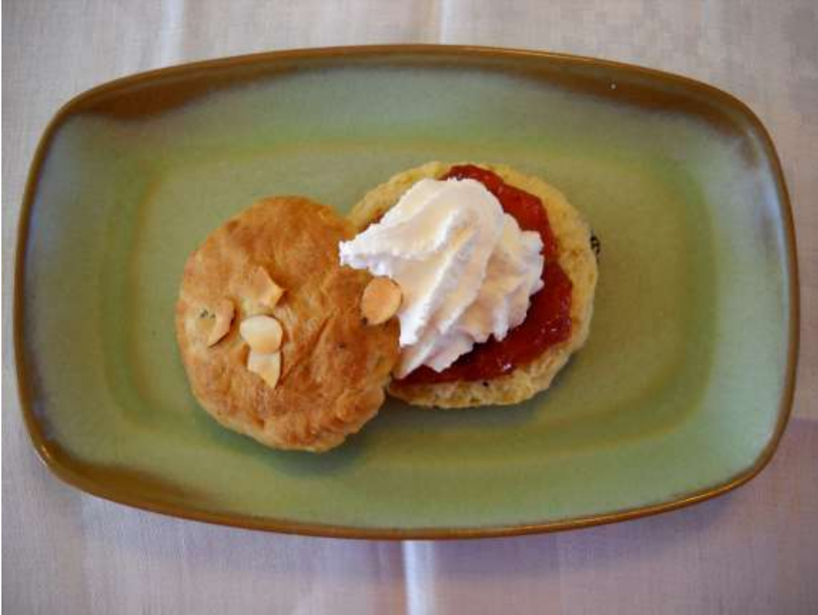
Figure 15. Berry Cherry Almond Scone