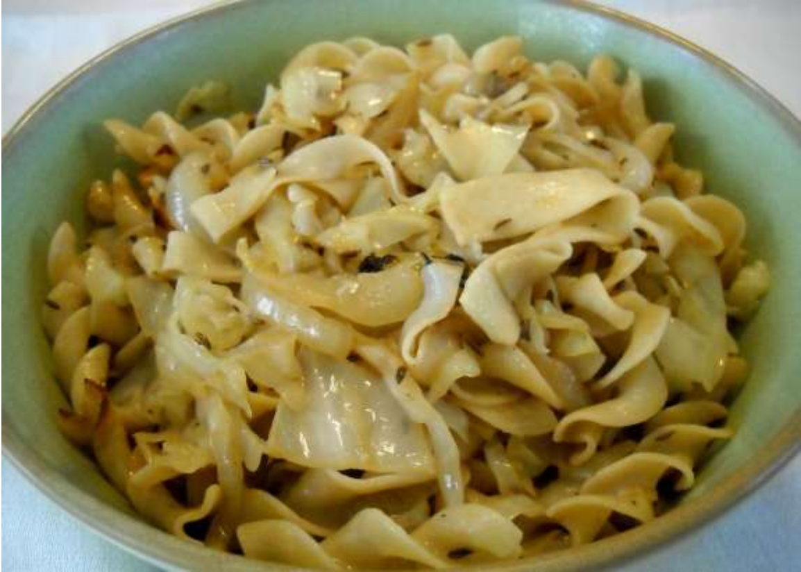
Figure 54. Fried Cabbage and Noodles