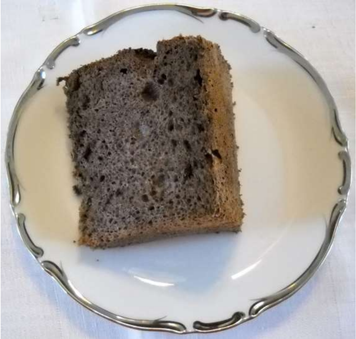
Figure 27. Chocolate Angel Food Cake