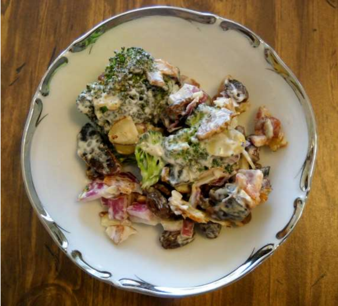
Figure 61. Broccoli Bacon Salad