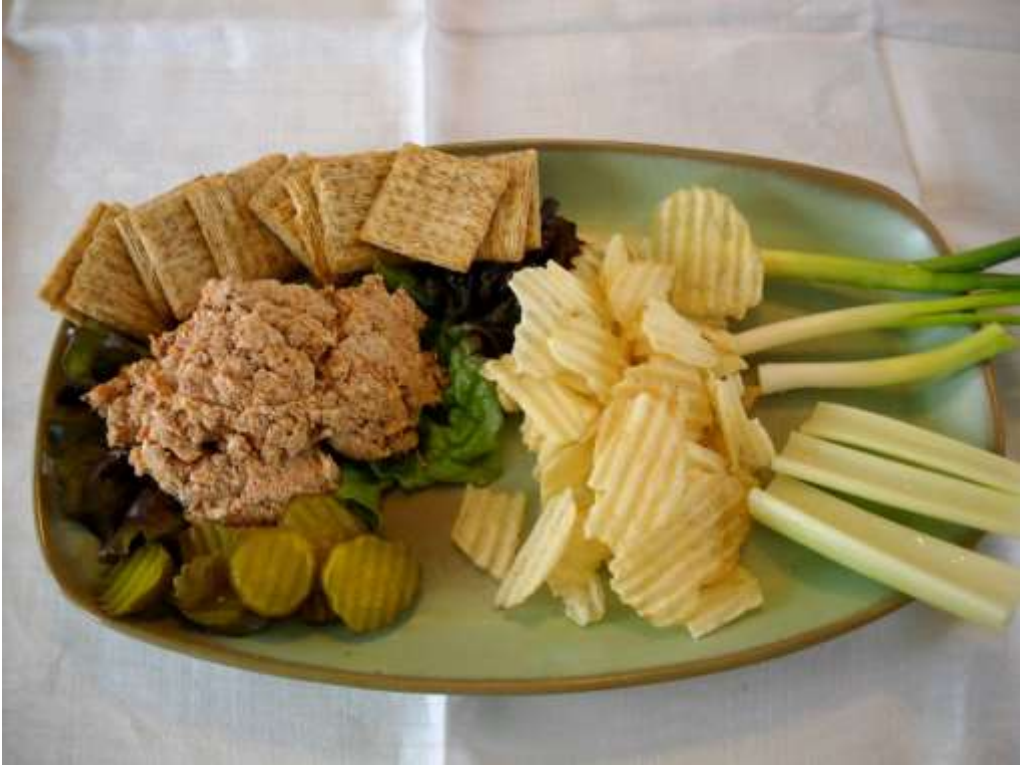
Figure 60. Beef Salad Lunch