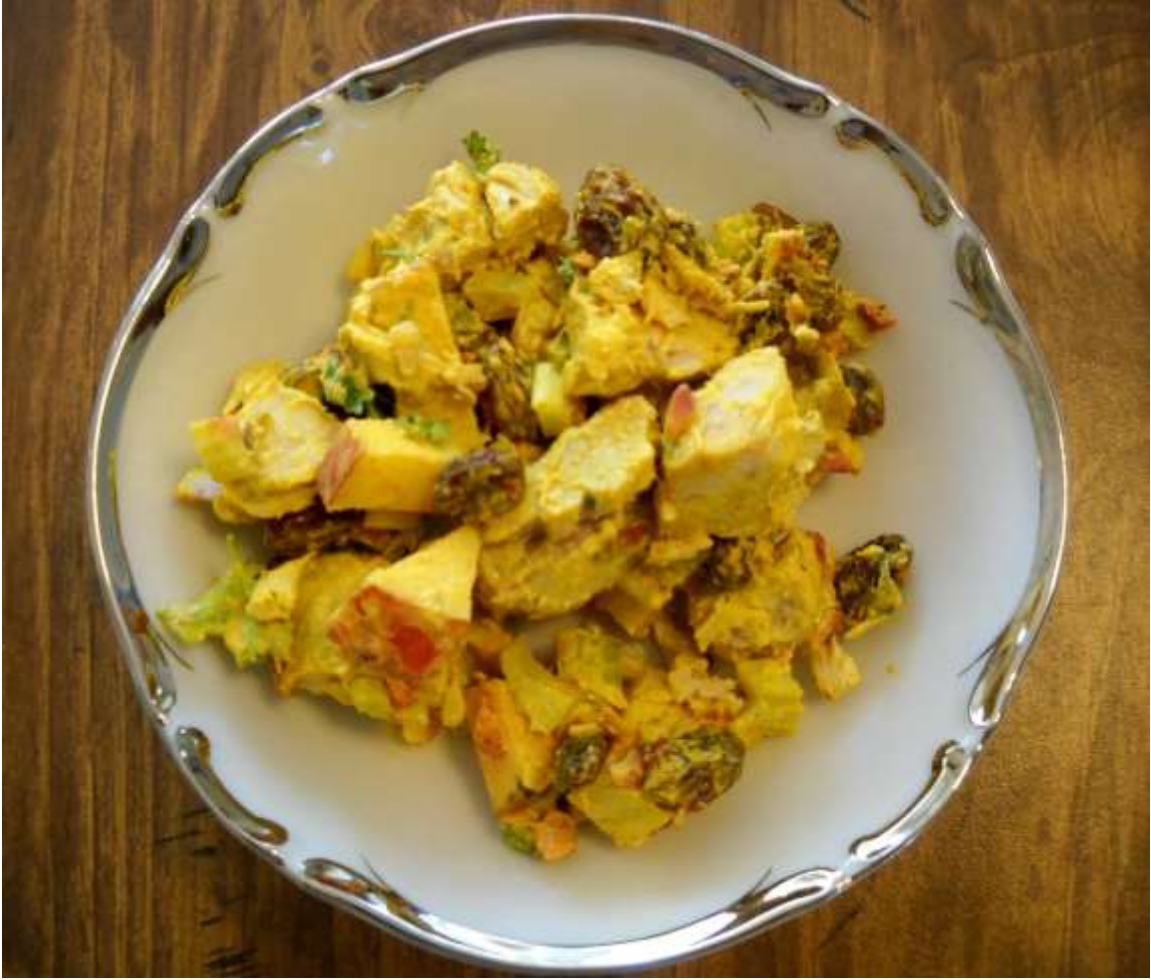
Figure 71. Turkey Salad #2