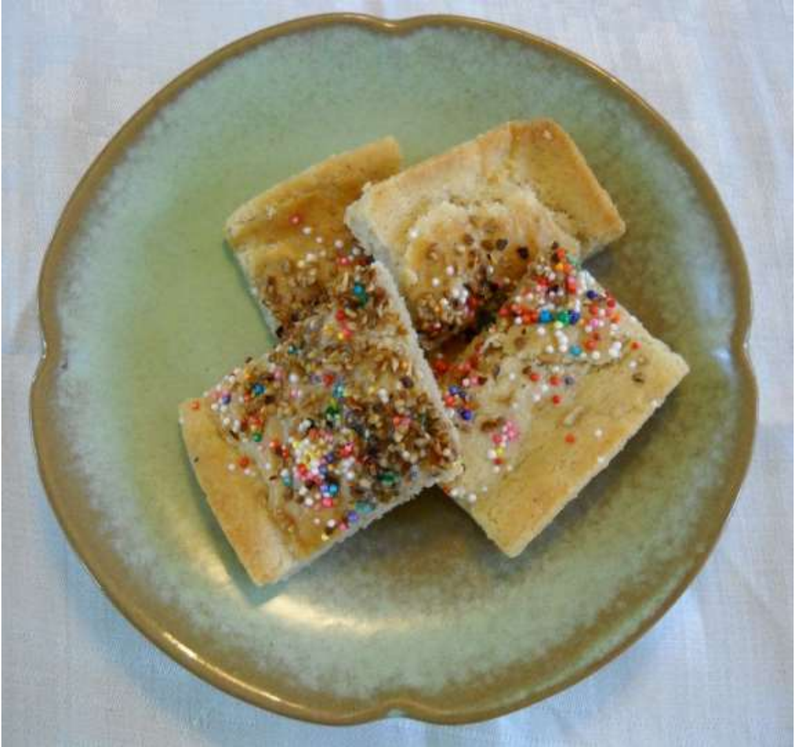
Figure 47. Soph's Cookies