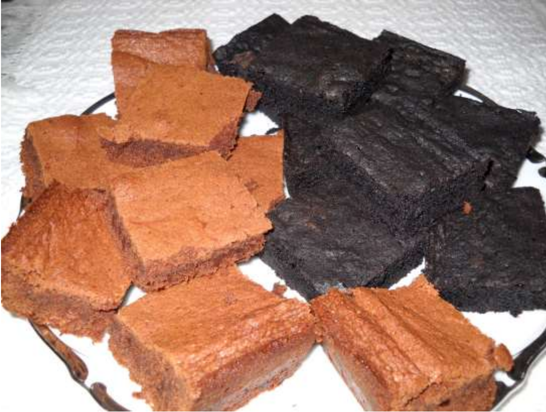
Figure 22. Brownies made with Hershey's All Natural processed cocoa and Hershey's Special Dark Dutch Processed cocoa.