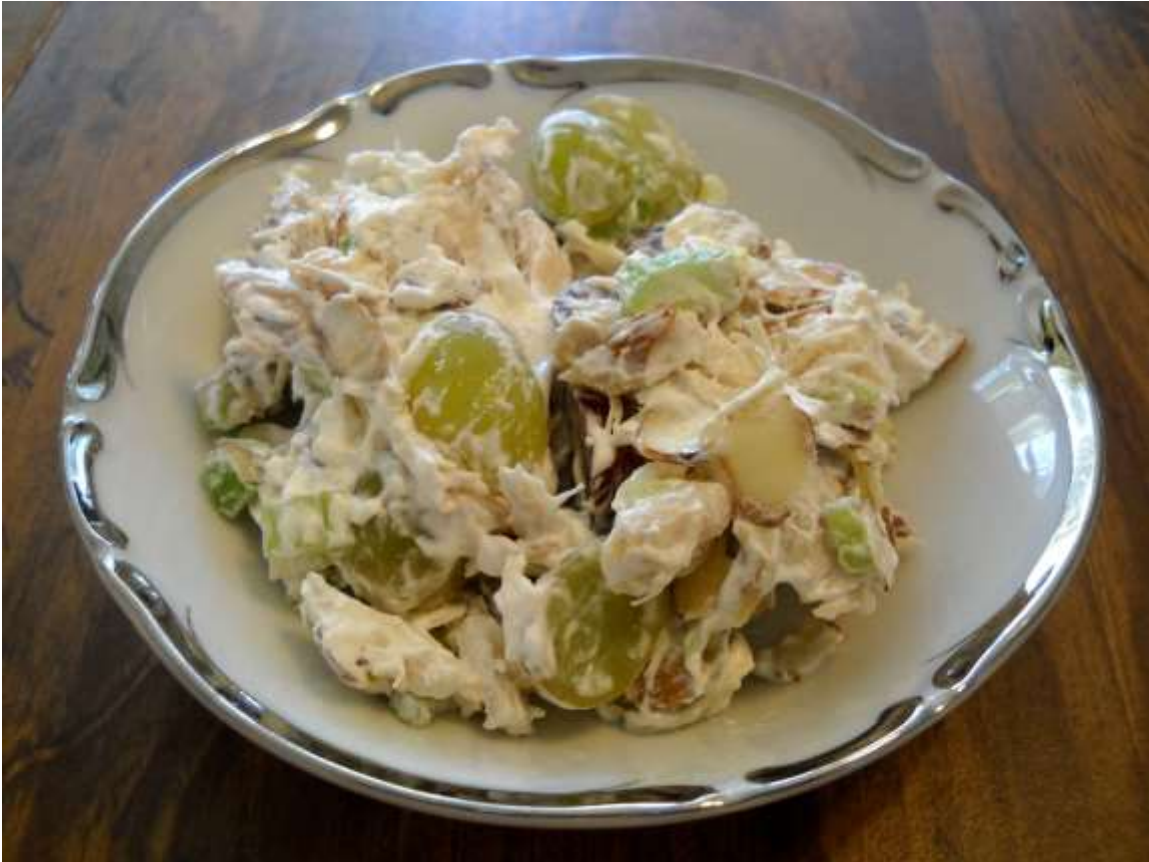
Figure 64. Chicken Salad #2 (Chicken Salad with Grapes and Apples)

The Waldorf Salad gave me the idea for this salad. Although about the only things this has in common with the Waldorf Salad are the whipped cream dressing, apples and grapes. This makes a light and crunchy salad.