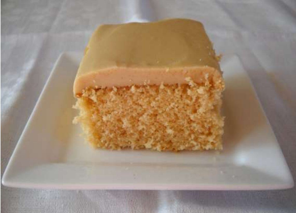
Figure 34. Cream Cake (not chocolate cream cake)