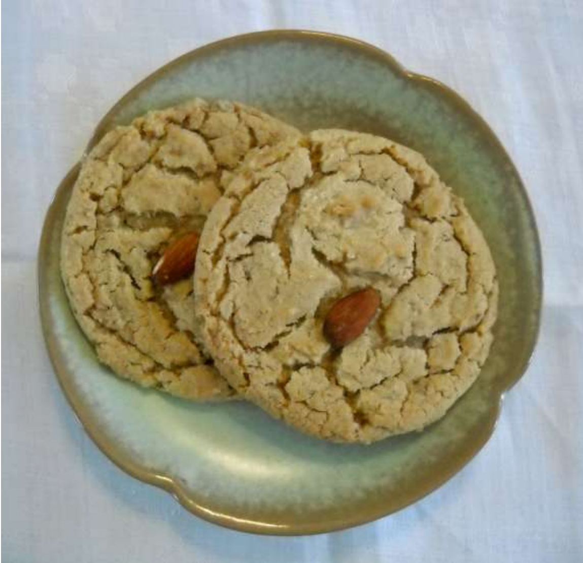
Figure 43. Chewy Jumbo Almond Cookies