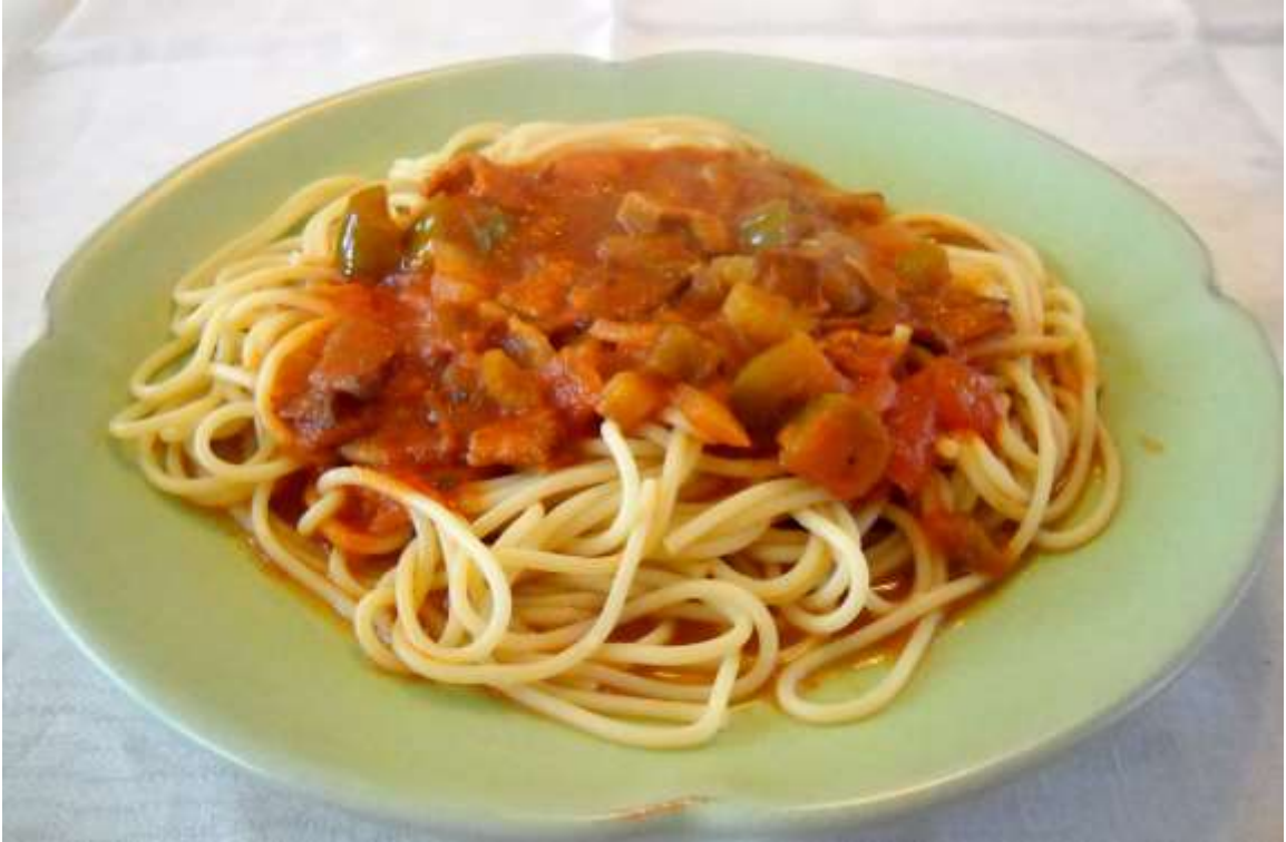
Figure 57. Spaghetti