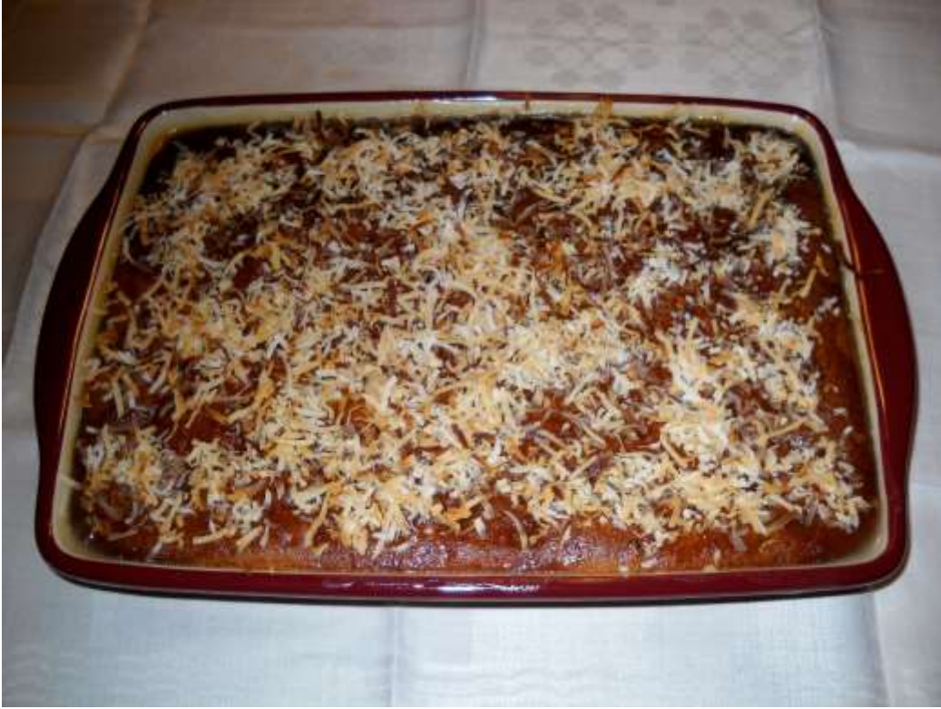
Figure 32. Coconut Cream Cake