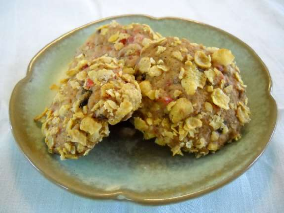
Figure 40. Cherry Winks