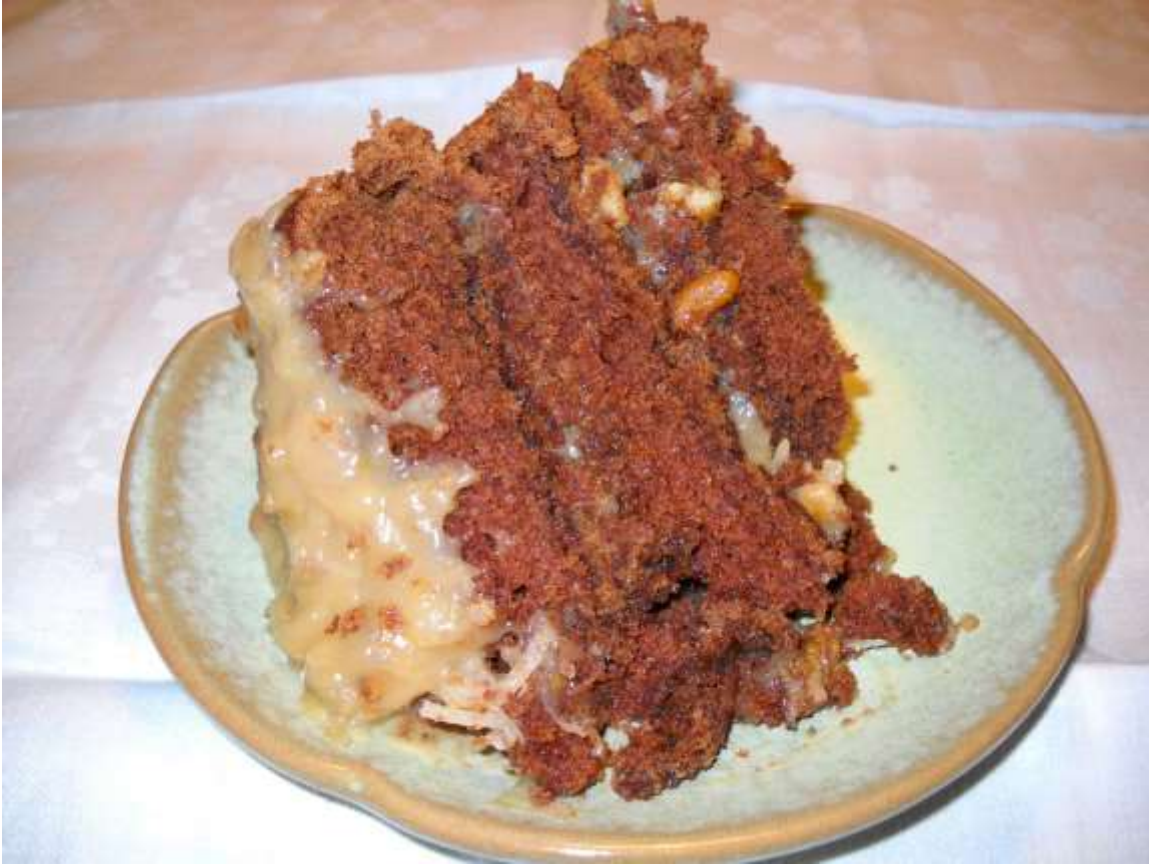
Figure 38. German Chocolate Cake with Coconut Pecan Filling/Frosting