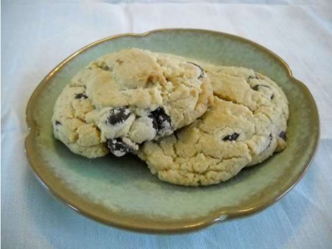
Figure 41. Chewy Jumbo Chocolate Chip Cookies