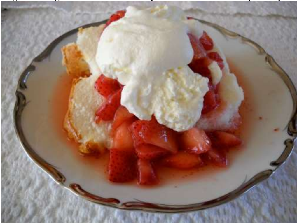
Figure 26. Angel Food Cake served with strawberries and whipped cream.