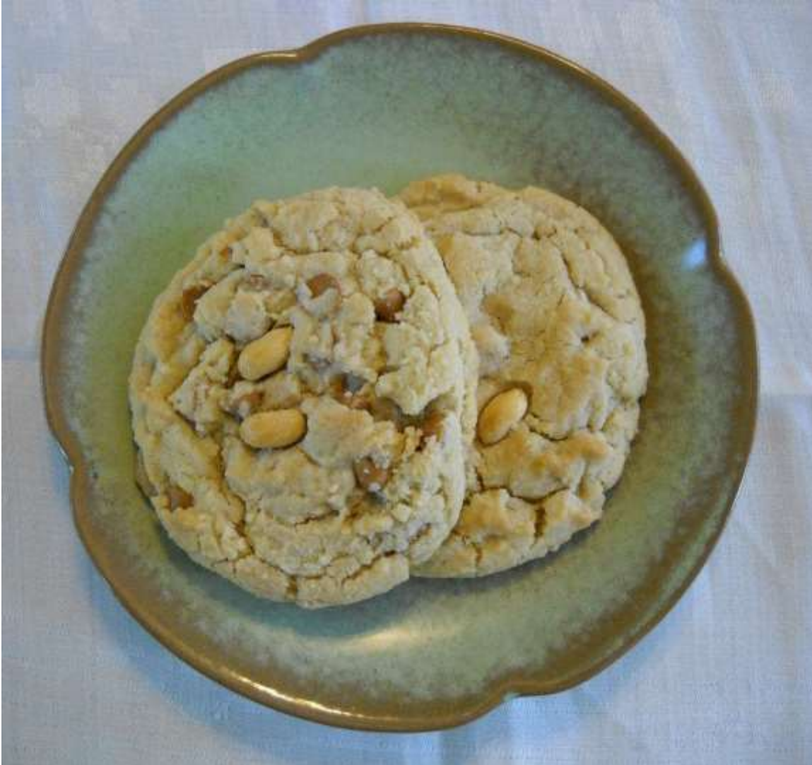
Figure 42. Chewy Jumbo Peanut Cookies