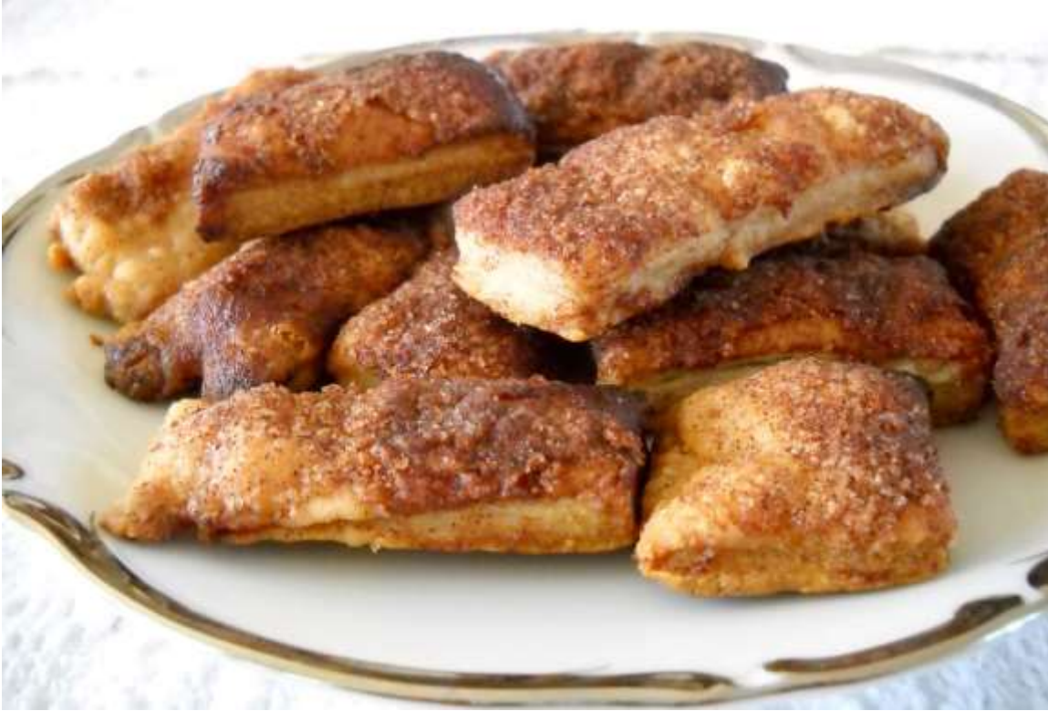
Figure 53. Cinnamon Crisps

One of the most delightful snacks to make from leftover pie dough is to make Cinnamon Crisps.