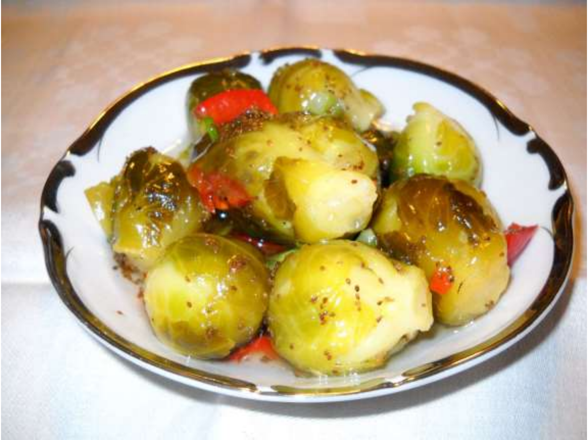
Figure 62. Brussels Sprout Salad