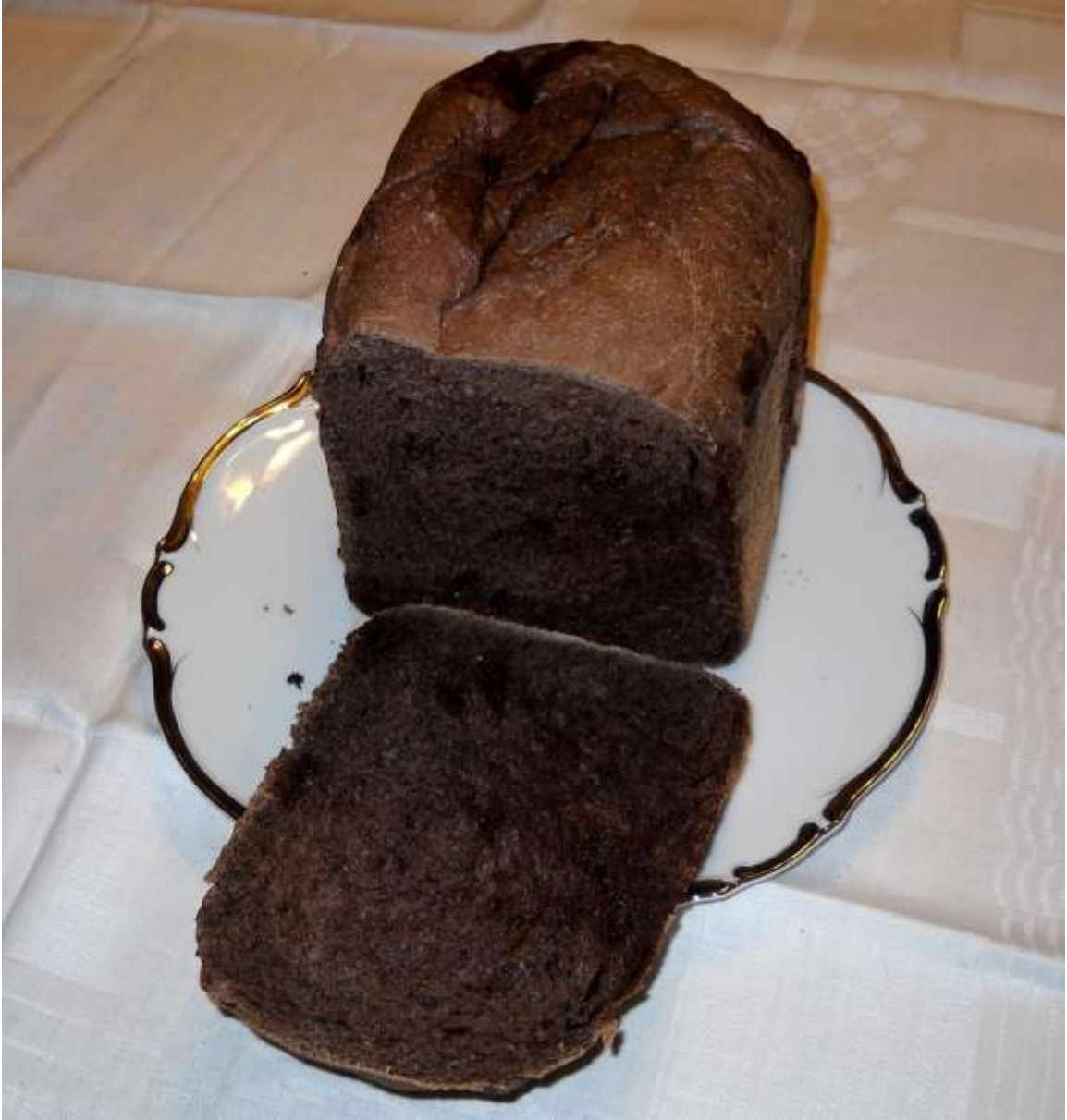
Figure 11. Chocolate Raspberry Bread