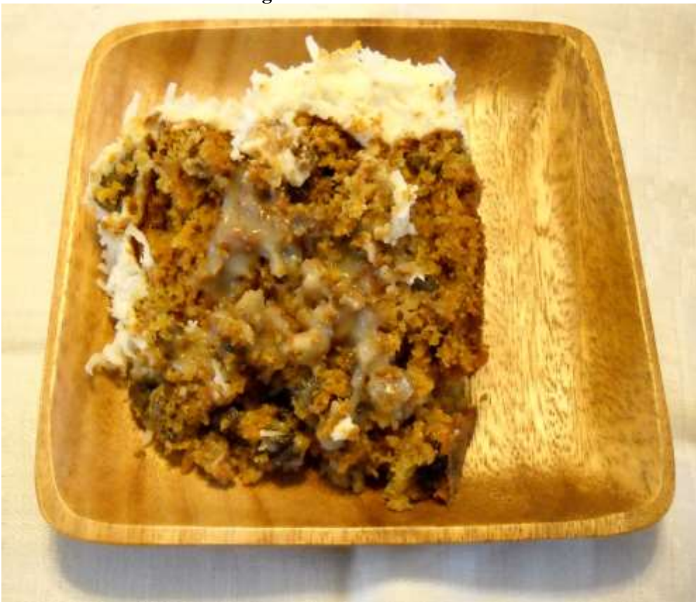
Figure 30. Piece of the Carrot Raisin Pecan Cake