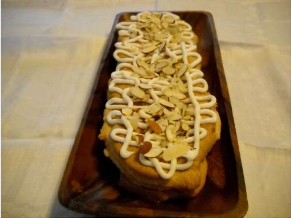
Figure 8. Breakfast Puff pastry made with Almonds