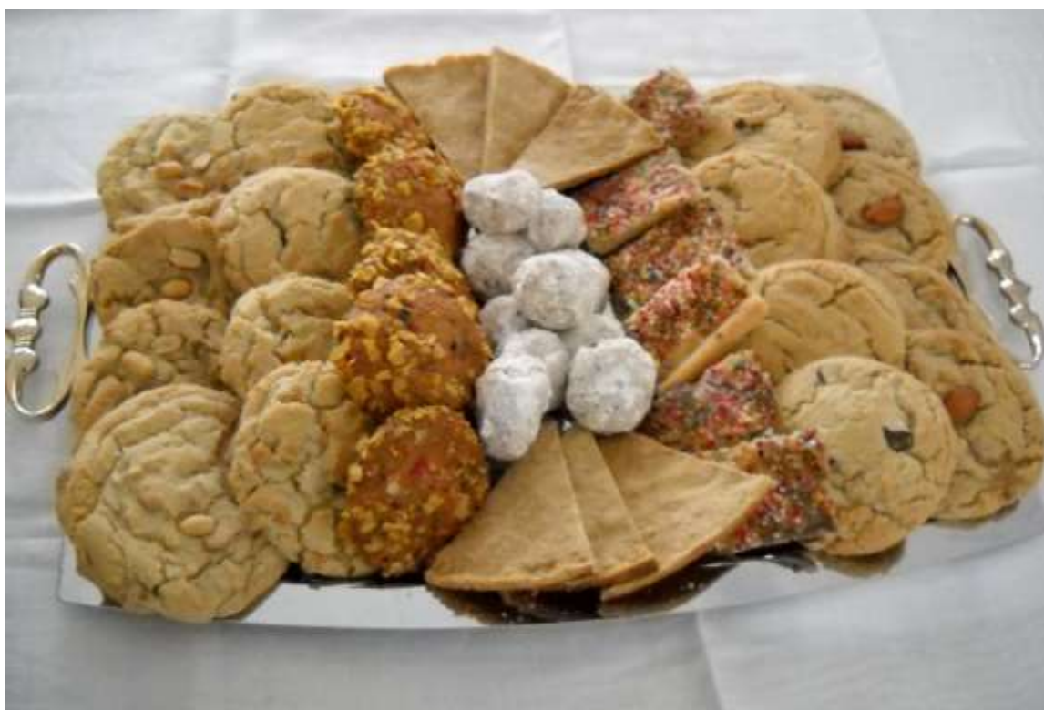
Figure 39. In the picture above from left to right are chewy jumbo peanut chip cookies, chewy jumbo toffee chip cookies, cherry winks, sandies (also known as wedding cookies), shortbread (pie shaped cookies), Sophies cookies, chewy jumbo chocolate chip cookies and chewy jumbo almond chip cookies.