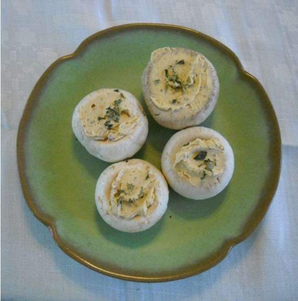
Figure 7. Sun Dried Tomato and Sweet Basil Stuffed Raw Mushrooms