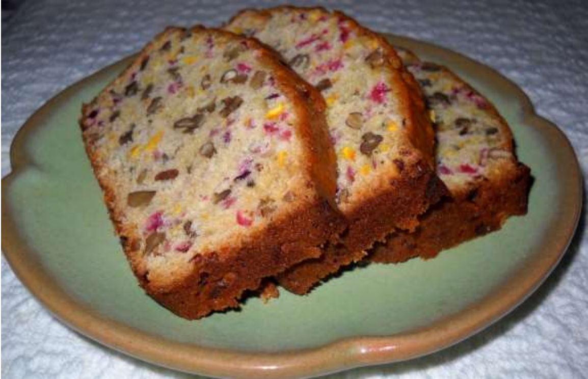
Figure 16. Cranberry-Orange Nut Bread