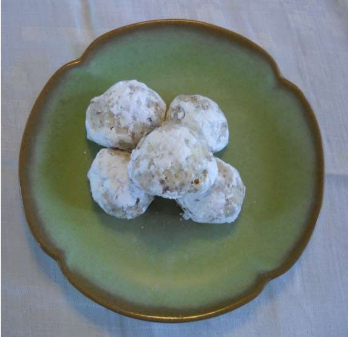
Figure 45. Sandies