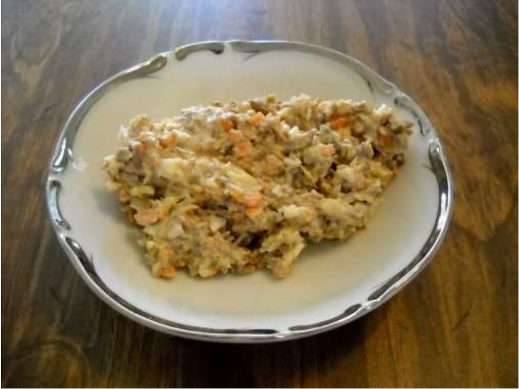
Figure 59. Beef Salad