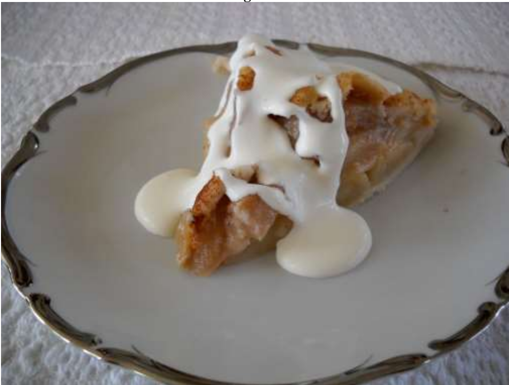
Figure 52. Slice of Pear Pie with thinned Cream Cheese Cinnamon Topping