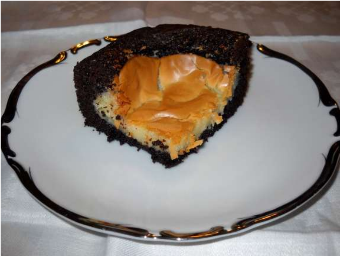
Figure 28. Black Bottom Cake

The Black Bottom Cake is my adaptation of the gooey butter cake. Don't be afraid to try different flavors of cake mixes. Just be certain that the cake mix you use does not have pudding added to the box mix.