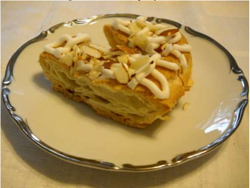
Figure 9. Piece of Breakfast Puff pastry made with Almonds