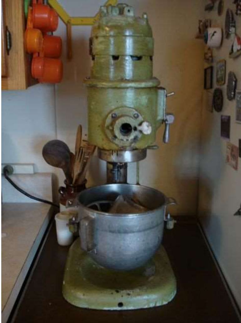
Figure 1. Author's Kitchen Aid Mixer

Throughout this cookbook you will find lists of geographic feature names in some way associated with the recipe or an ingredient in the recipe or a kitchen tool used to make the recipe. All searches were done at the public web site. For those records that don't appear to have the appropriate word in the feature name, then that word will be found in a variant name for that feature, but in trying to keep this book to a somewhat reasonable size, the variant names are not listed.