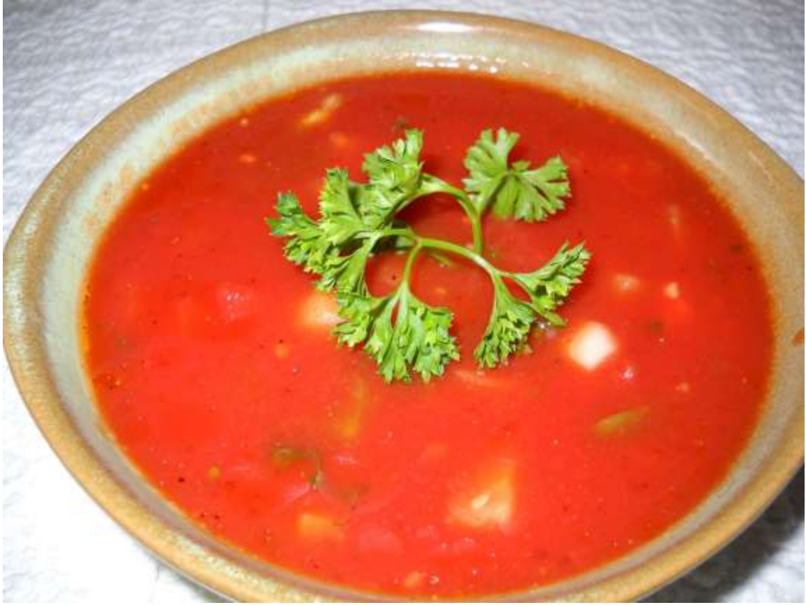
Figure 4. Gazpacho