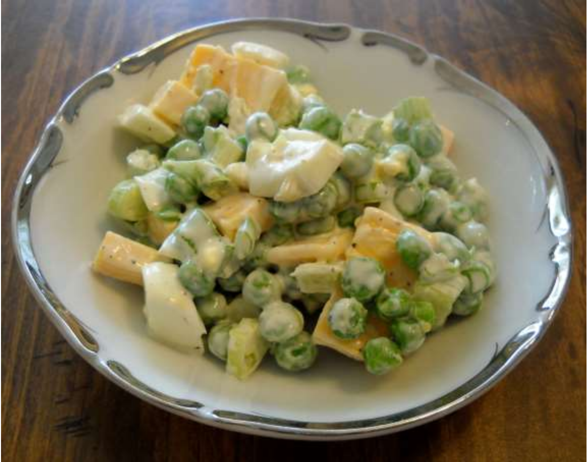
Figure 68. Pea Salad