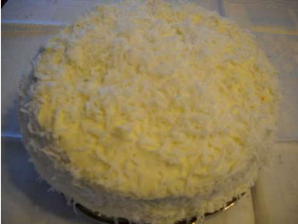
Figure 29. Carrot Raisin Pecan Cake