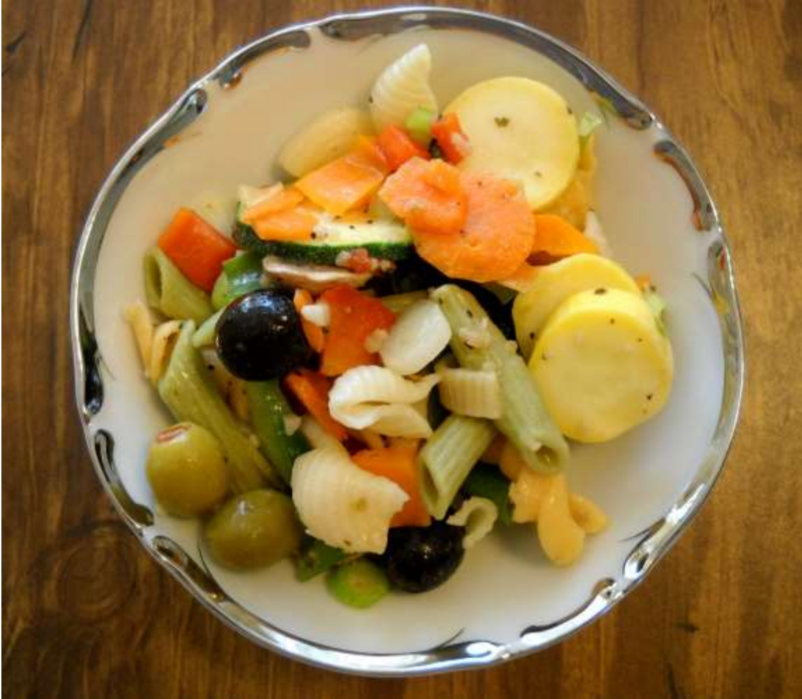
Figure 67. Pasta Salad