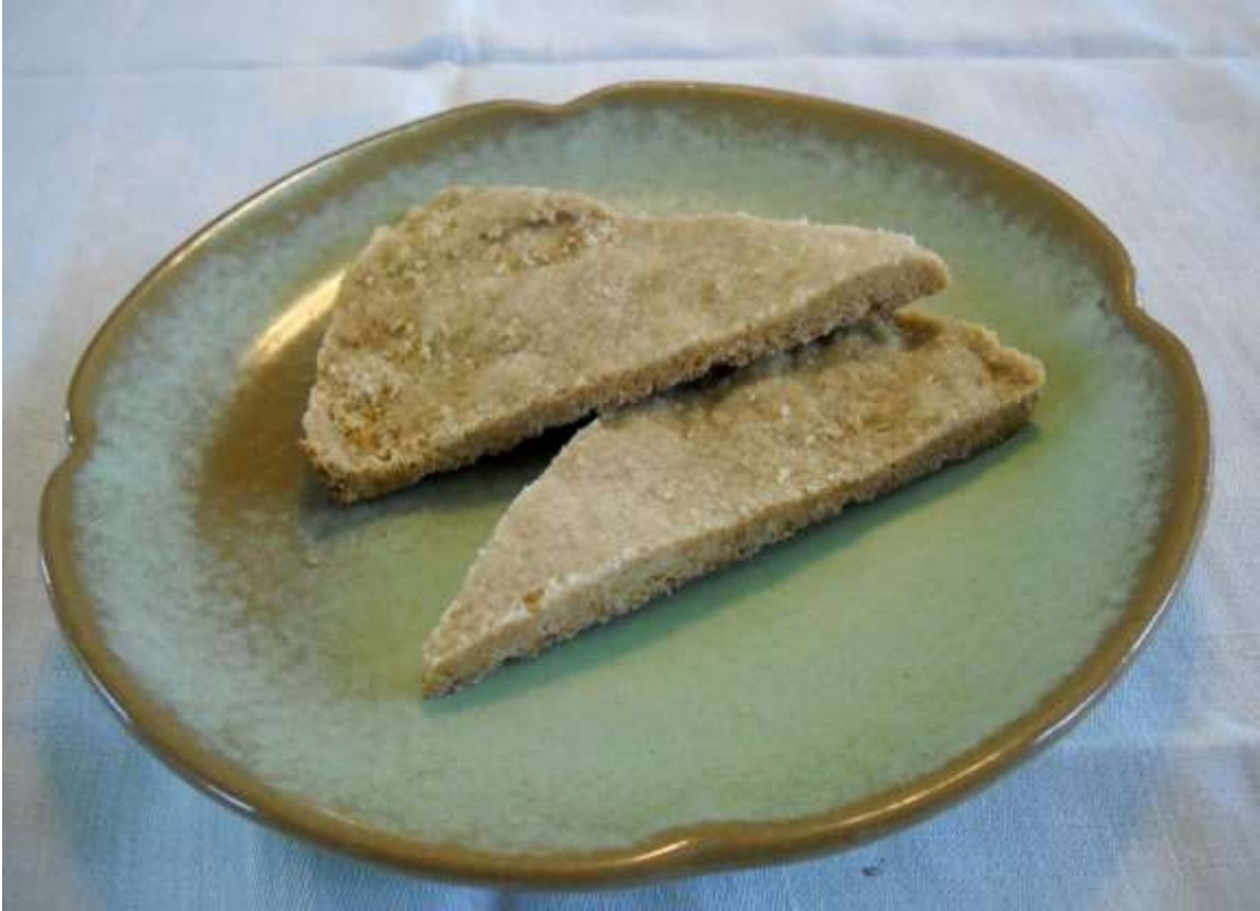
Figure 46. Scottish Shortbread