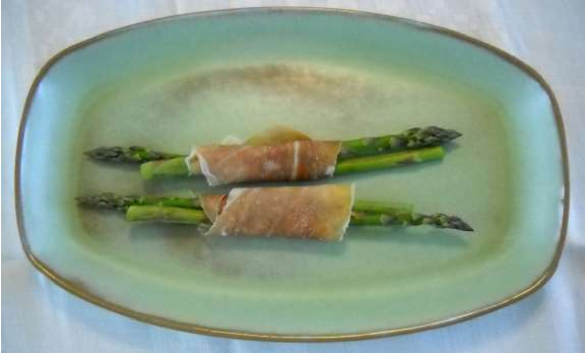
Figure 5. Ham Wrapped Fresh Asparagus