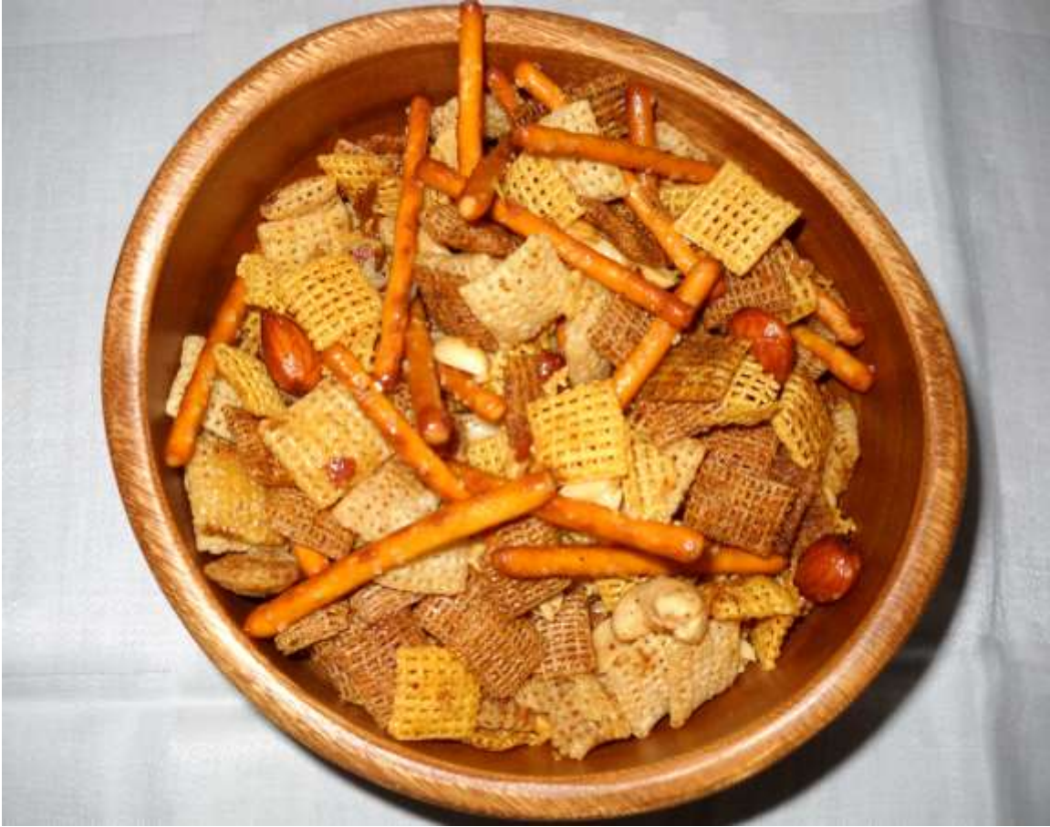
Figure 55. Mom's Chex® Mix