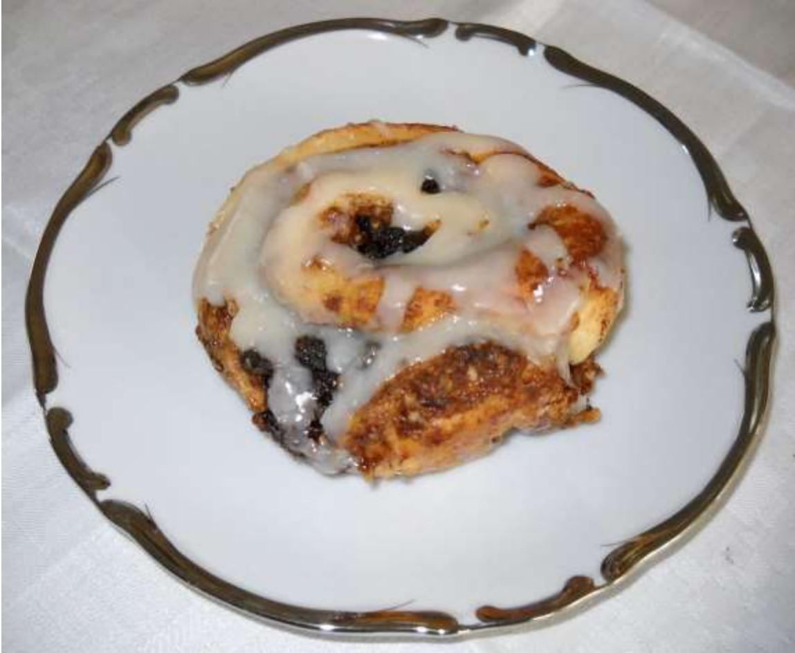
Figure 13. Cinnamon Pecan Raisin Roll