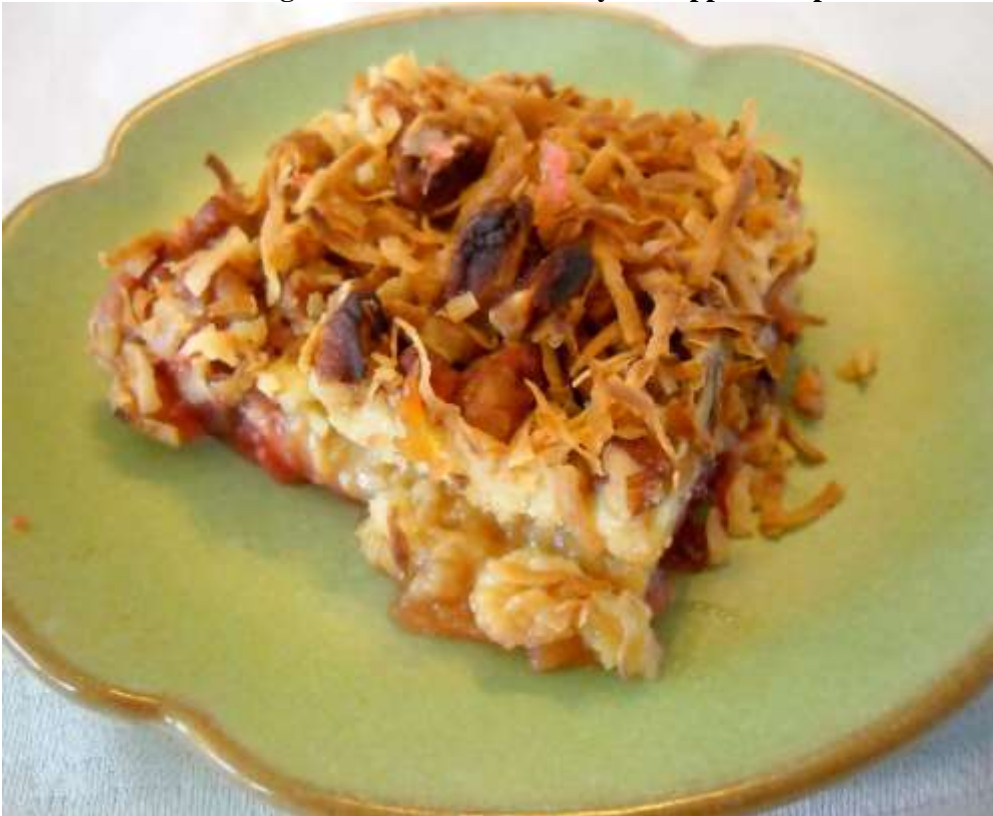
Figure 37. Yellow Cherry Pineapple Dump Cake