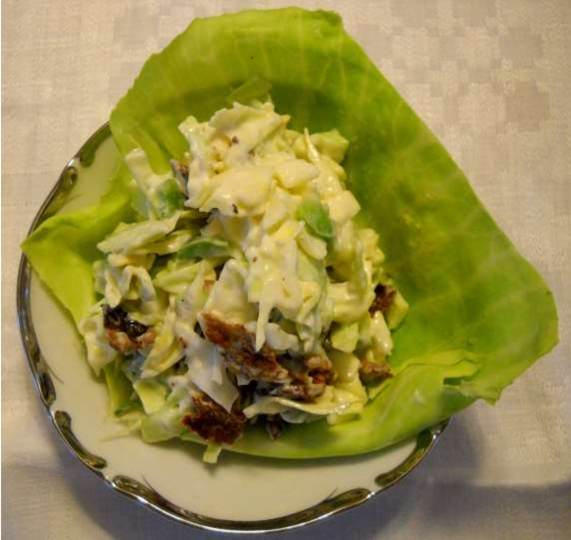
Figure 65. Coleslaw