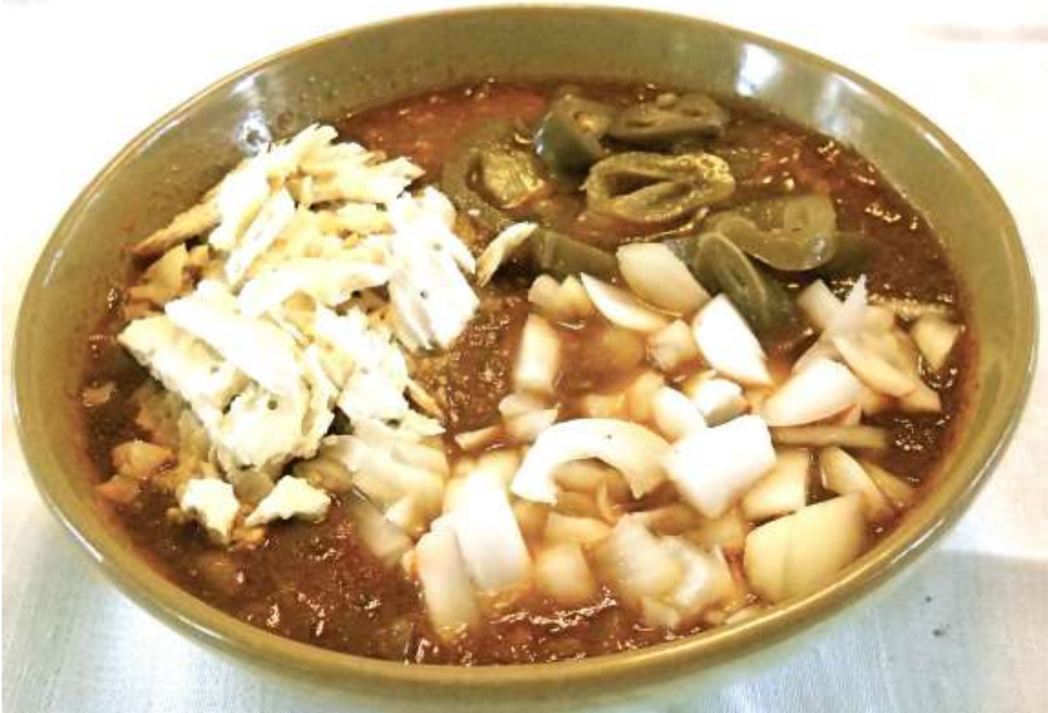
Figure 3. Chili Topped with Raw Onion, Jalapeño Peppers and Crushed Saltine Crackers