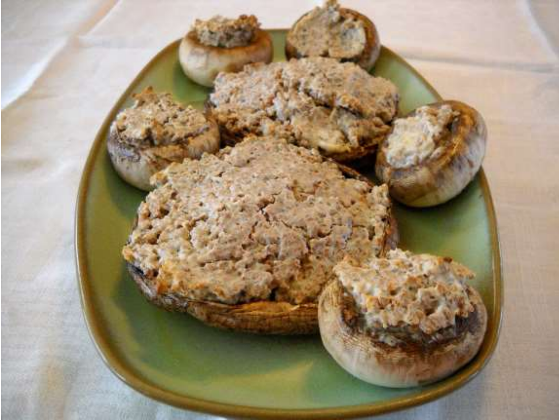
Figure 6. Baked Stuffed Portobello and White Button Mushrooms