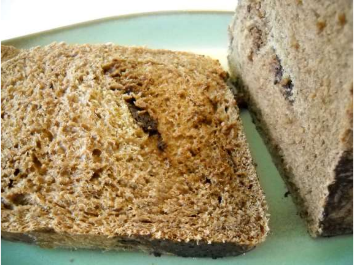
Figure 19. Mocha Bread