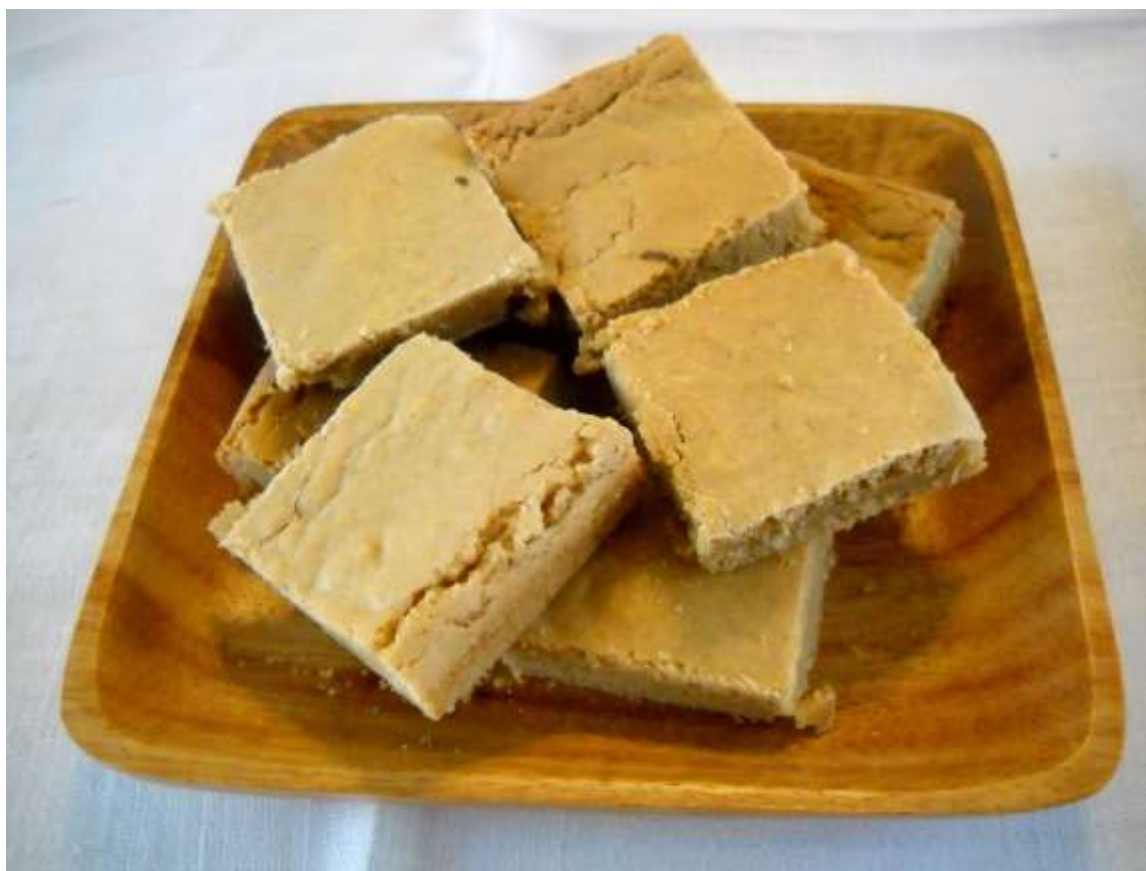
Figure 24. Blond (Blonde Brownies)

Mix butter and sugars until well blended. Sift flour, baking powder and salt. Add eggs and vanilla to the butter and sugar mixture and beat until well mixed. Add dry ingredients to the butter sugar mixture and mix until smooth. Pat into baking pan and bake at 350° 20 – 30 minutes (until a toothpick or knife inserted in the center comes out clean).