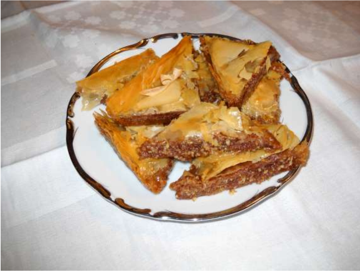
Figure 21. Baklava