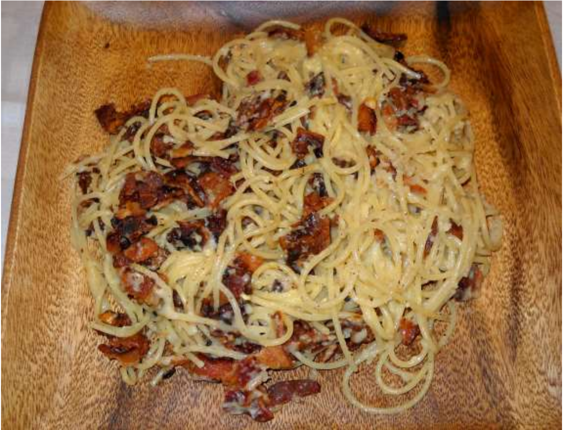
Figure 58. Spaghetti Carbonara Roma