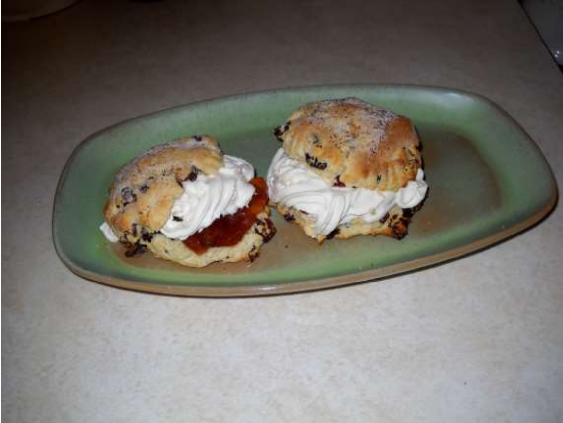
Figure 14. Cranberry Orange Scones with Strawberry Jam and Whipped Cream