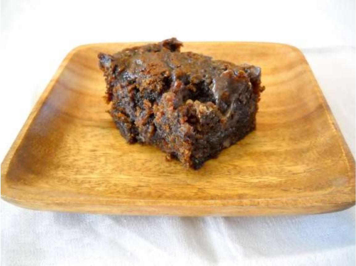
Figure 35. Date Cake