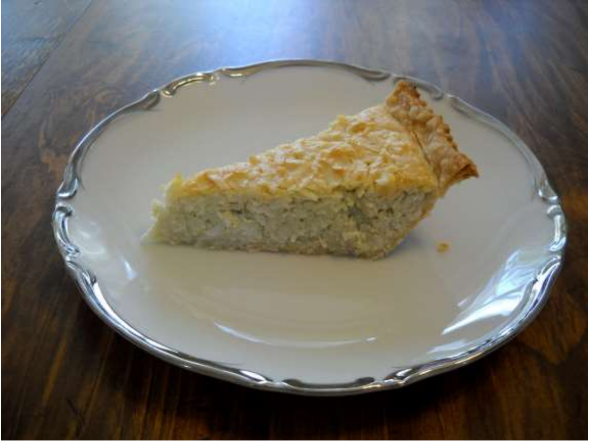
Figure 49. French Coconut Pie – No Sugar Added