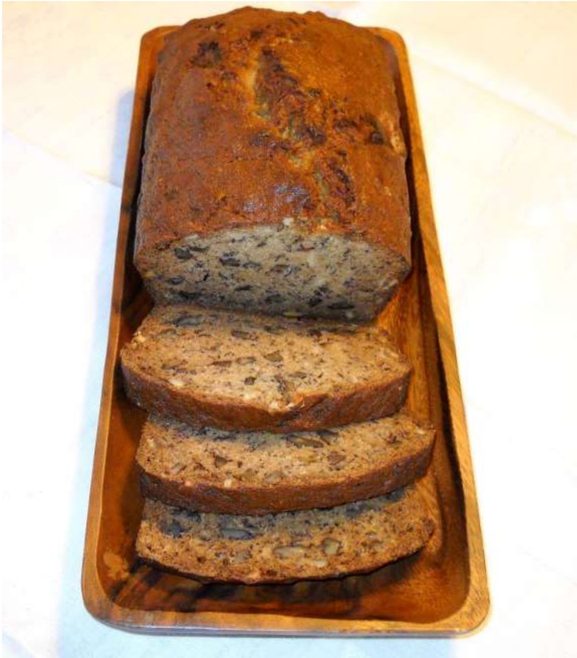
Figure 10. Banana Nut Bread