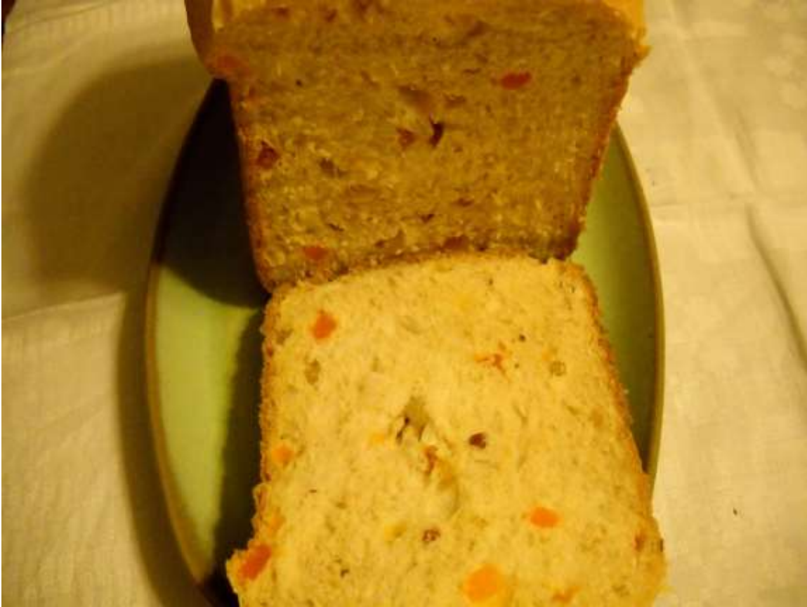
Figure 20. Tropical Fruit Medley Bread