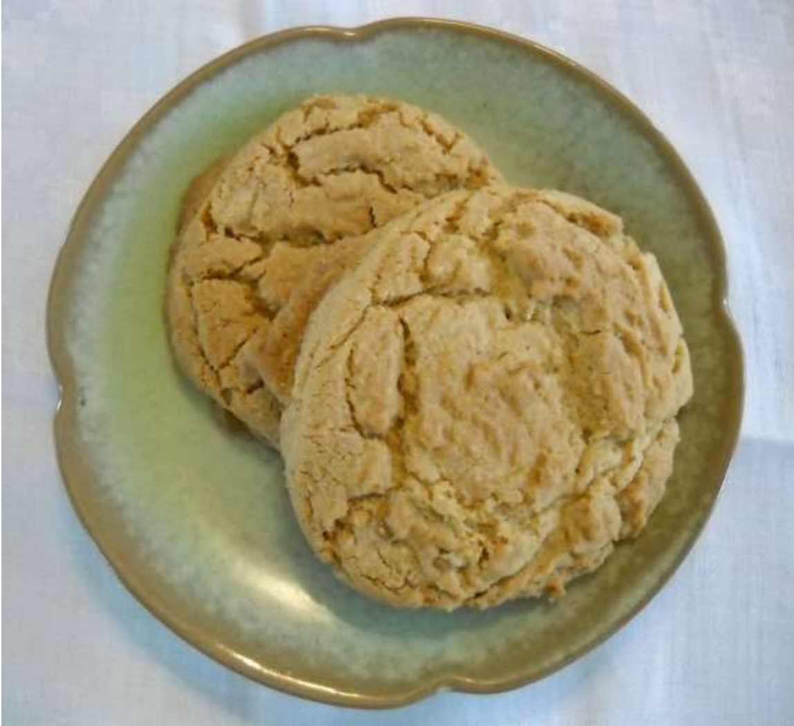
Figure 44. Chewy Jumbo Toffee Cookies