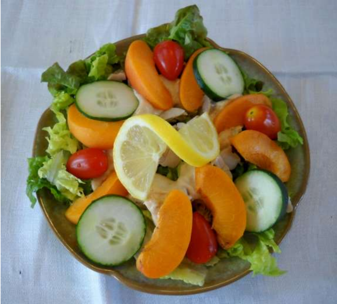
Figure 2. Coronation Chicken