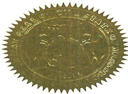
MICHAEL L. PARSON GOVERNOR

IN WITNESS WHEREOF, I have hereunto set my hand and caused to be affixed the Great Seal of the State of Missouri, in the City of Jefferson, on this 26th day of April, 2024.