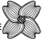
EXHIBIT B State of Missouri Department of Insurance (Complete in duplicate)